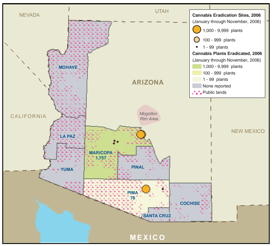
Figure 2. Cannabis eradication sites in the Arizona HIDTA region, 2006.

being smuggled from Mexico to Arizona, where it was going to be separated, mixed with hydrogen chloride (HCl), "bubbled," and then crystallized into ice methamphetamine. This smuggling technique is increasingly used by Mexican traffickers, who take extra precautions to avoid law enforcement interdiction, particularly during production.