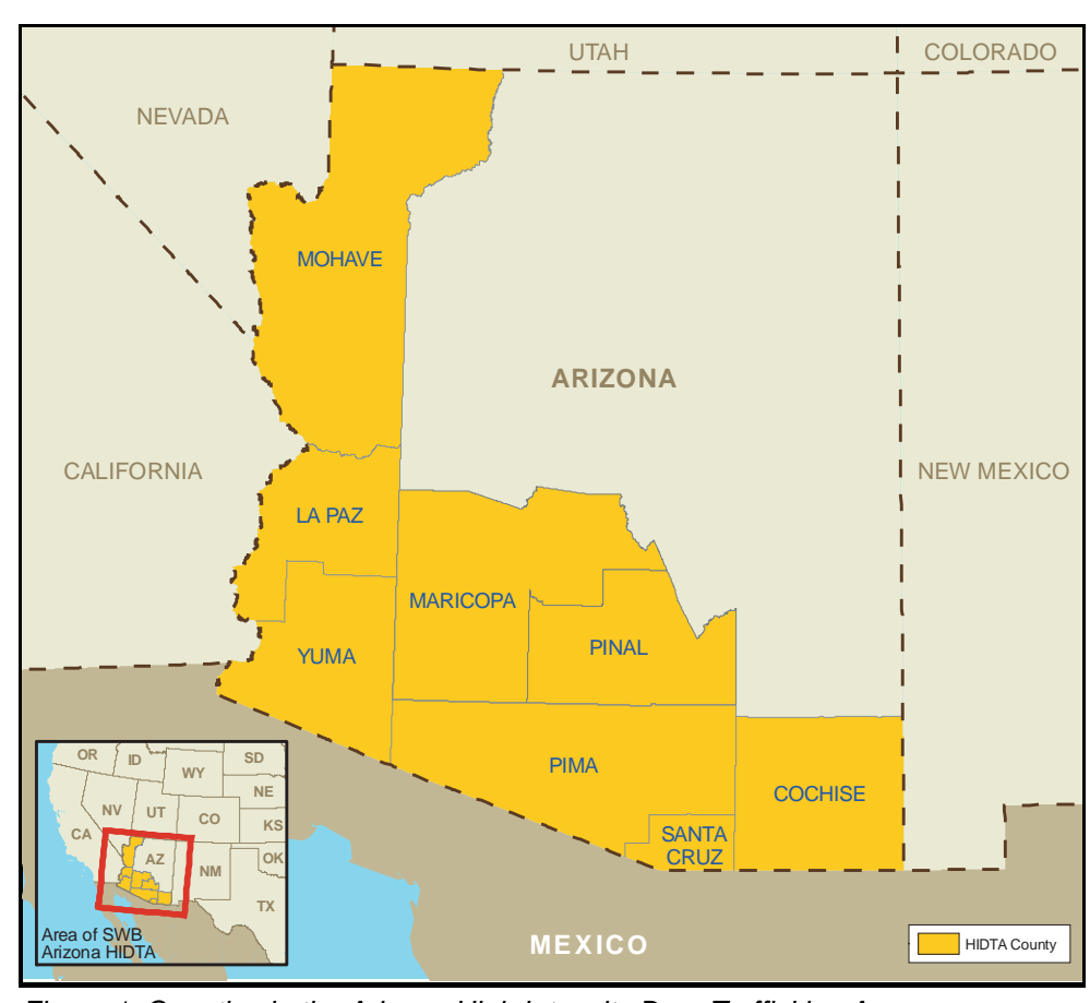
Figure 1. Counties in the Arizona High Intensity Drug Trafficking Area.

reporting, information obtained through interviews with law enforcement and public health officials, and available statistical data. The report is designed to provide policymakers, resource planners, and law enforcement officials with a focused discussion of key drug issues and developments facing the Arizona HIDTA.