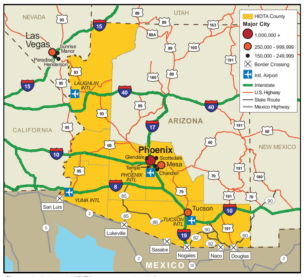
Figure 3. Arizona HIDTA transportation infrastructure.

smaller loads (20 to 100 kg) than they had transported previously, particularly when smuggling cocaine, most likely to cut their losses in the event of law enforcement interdiction. Smaller drug loads typically are stored in stash houses in the Nogales area for consolidation and eventual bulk transport to Tucson and Phoenix. Once in Tucson and Phoenix, some of the drugs are distributed locally; however, significant quantities are repackaged and shipped to other U.S. destinations, including Colorado, Georgia, Indiana, Kansas, Kentucky, Missouri, Nebraska, Ohio, Utah, and Wisconsin. Most drug proceeds are transported in the reverse direction, often in the same vehicles used to transport illicit drugs to the area.