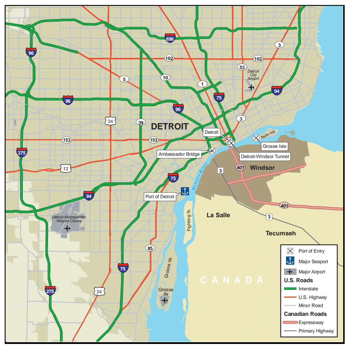
Figure 2. International border between Detroit, Michigan, and Windsor, Ontario.

throughout Michigan and several other states, including Georgia, Kentucky, Ohio, Pennsylvania, and West Virginia.