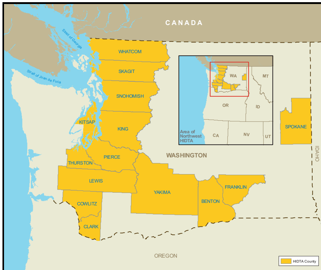
Figure 1. Northwest High Intensity Drug Trafficking Area.

recent law enforcement reporting, information obtained through interviews with law enforcement and public health officials, and available statistical data. The report is designed to provide policymakers, resource planners, and law enforcement officials with a focused discussion of key drug issues and developments facing the Northwest HIDTA.