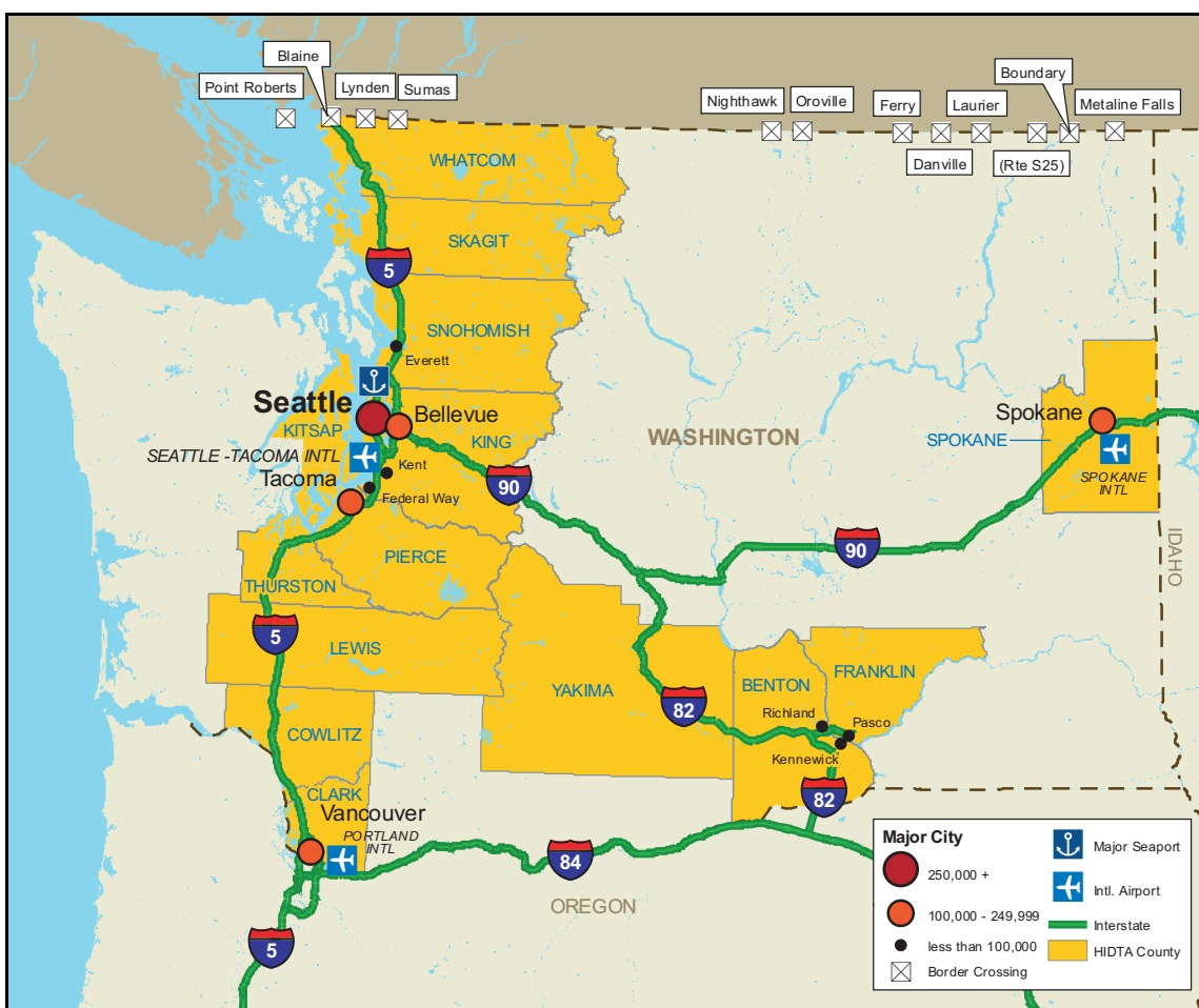
Figure 2. Northwest HIDTA transportation infrastructure.