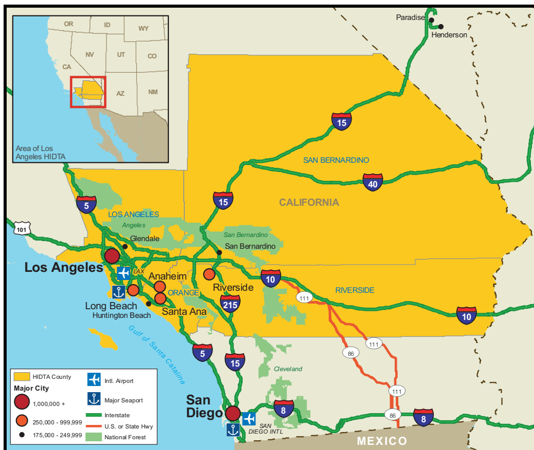
Figure 1. Los Angeles High Intensity Drug Trafficking Area.

reporting, information obtained through interviews with law enforcement and public health officials, and available statistical data. The report is designed to provide policymakers, resource planners, and law enforcement officials with a focused discussion of key drug issues and developments facing the Los Angeles HIDTA region.