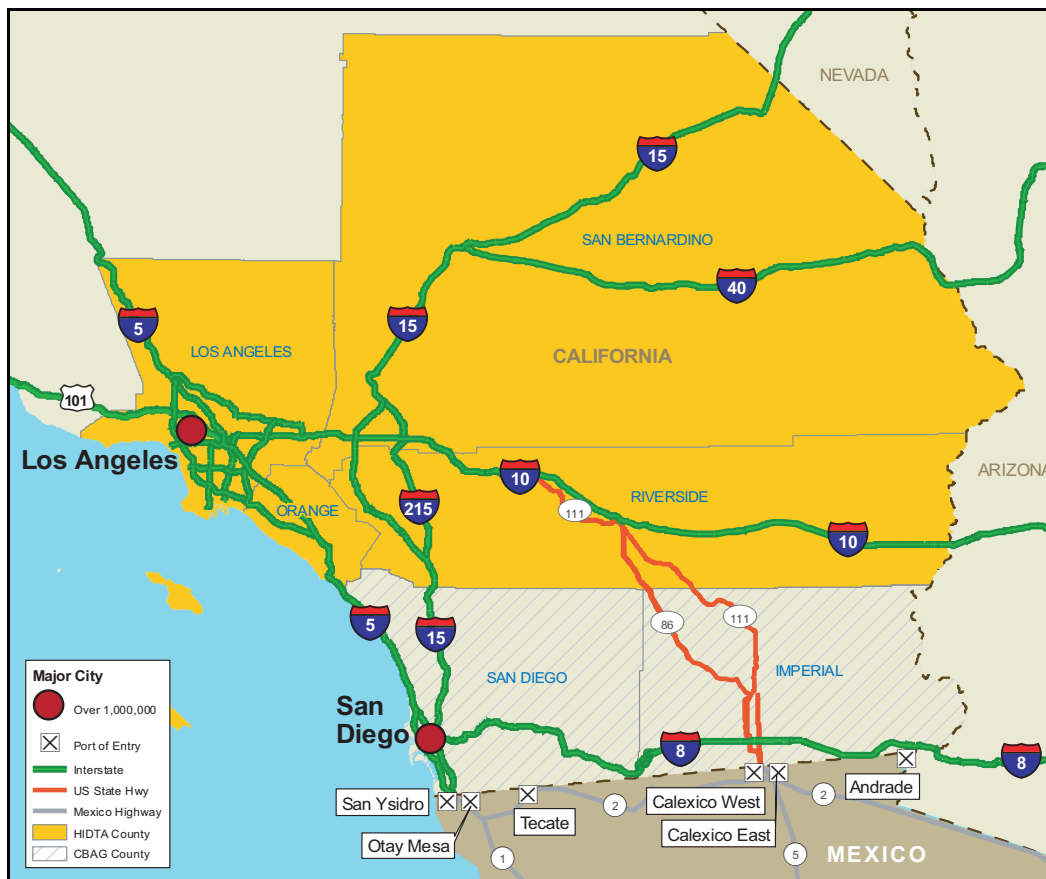
Figure 3. Los Angeles HIDTA transportation infrastructure.

remuneration. Mexican DTOs and criminal groups as well as various other traffickers (Colombian, Jamaican, Asian, Israeli, Russian, Caucasian, and African American) transport illicit drugs to and through the HIDTA region on numerous roadways, including Interstates 5 and 15. These roadways connect the HIDTA region directly to POEs along the California–Mexico (see Figure 3) and the U.S.–Canada borders as well as to other U.S. source areas. For example, Asian and Caucasian criminal groups and independent dealers transport MDMA and high-potency Canadian marijuana into the Los Angeles HIDTA region overland in private vehicles from northern California, the Pacific Northwest, and Canada. In addition, some drug transporters, including some in Europe and Asia, smuggle illicit drugs through the international air and maritime ports situated in or near the Los Angeles HIDTA region, which further augments the HIDTA’s role as an illicit drug transportation center. Some of the