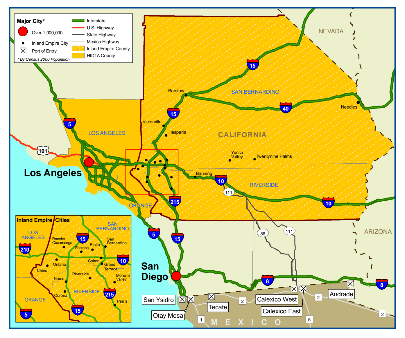
Figure 1. Los Angeles High Intensity Drug Trafficking Area.

This assessment provides a strategic overview of the illicit drug situation in the Los Angeles High Intensity Drug Trafficking Area (HIDTA) region, highlighting significant trends and law enforcement concerns related to the trafficking and abuse of illicit drugs. The report was prepared through detailed analysis of recent law enforcement reporting, information obtained through interviews with law enforcement and public health officials, and available statistical data. The report is designed to provide policymakers, resource planners, and law enforcement officials with a focused discussion of key drug issues and developments facing the Los Angeles HIDTA.