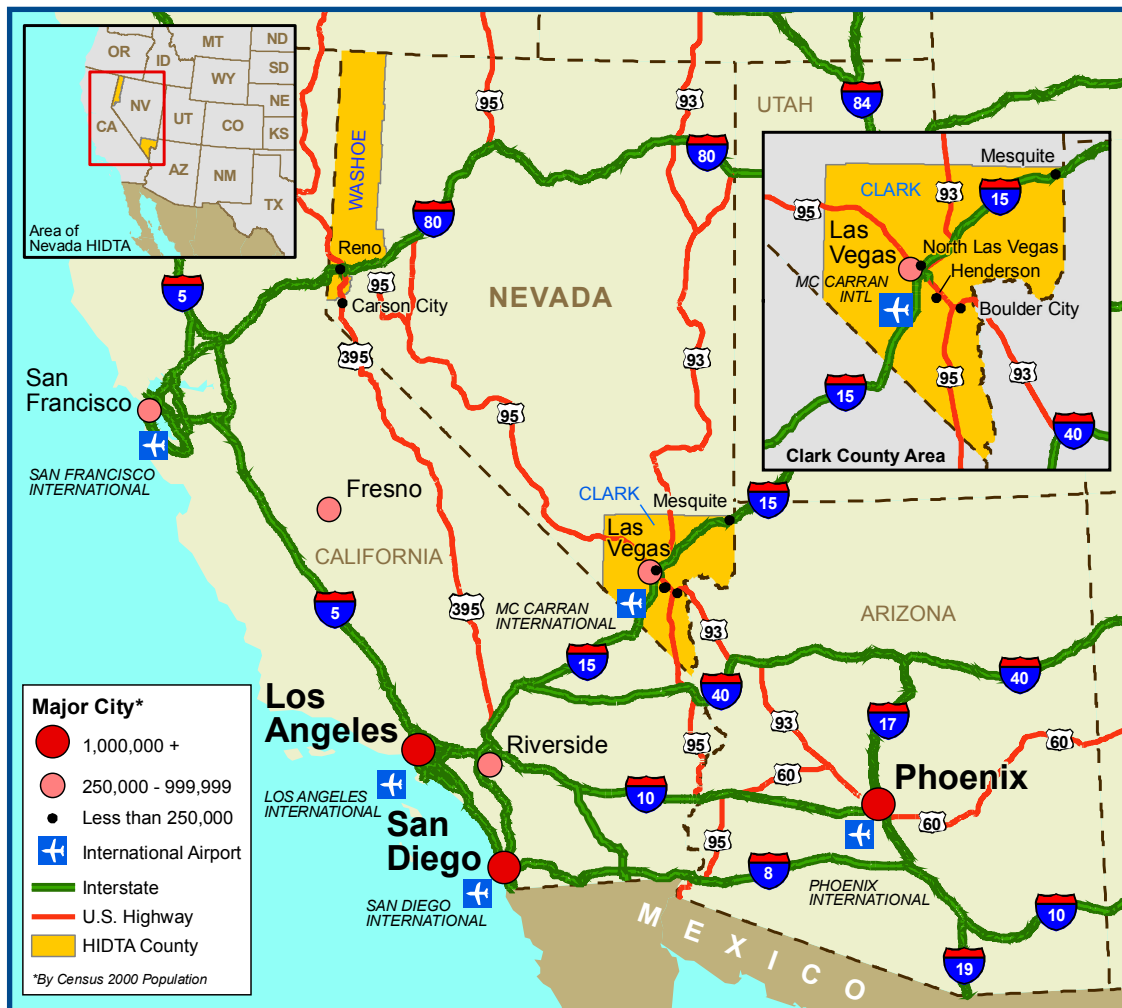
Figure 1. Nevada High Intensity Drug Trafficking Area.

This assessment provides a strategic overview of the illicit drug situation in the Nevada High Intensity Drug Trafficking Area (HIDTA), highlighting significant trends and law enforcement concerns related to the trafficking and abuse of illicit drugs. The report was prepared through detailed analysis of recent law enforcement reporting, information obtained through interviews with law enforcement and public health officials, and available statistical data. The report is designed to provide policymakers, resource planners, and law enforcement officials with a focused discussion of key drug issues and developments facing the Nevada HIDTA.