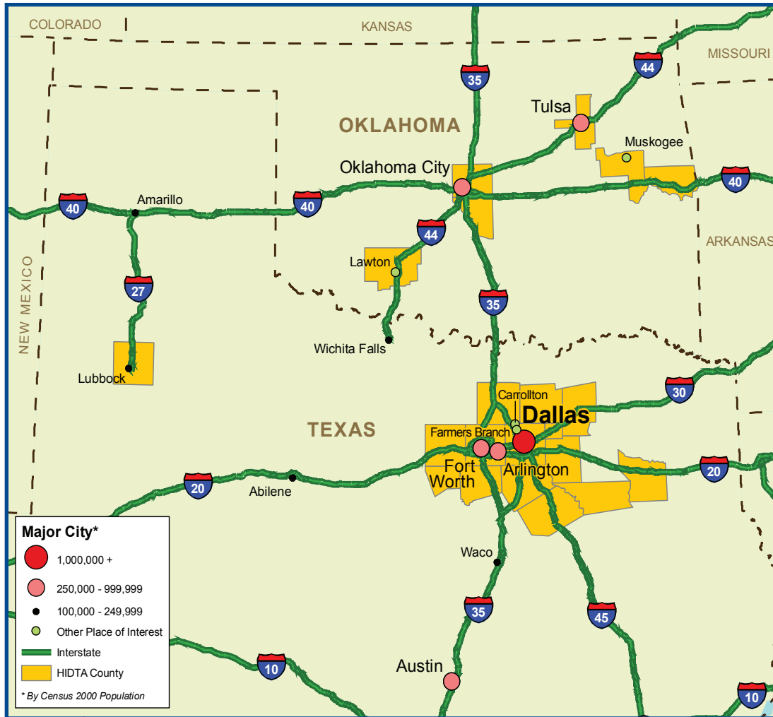
Figure 2. North Texas HIDTA transportation infrastructure.

point for illicit drugs transported to other U.S. drug markets, including those in Arkansas, Florida, Georgia, Illinois, Kentucky, Louisiana, Michigan, Missouri, North Carolina, Ohio, and Tennessee.