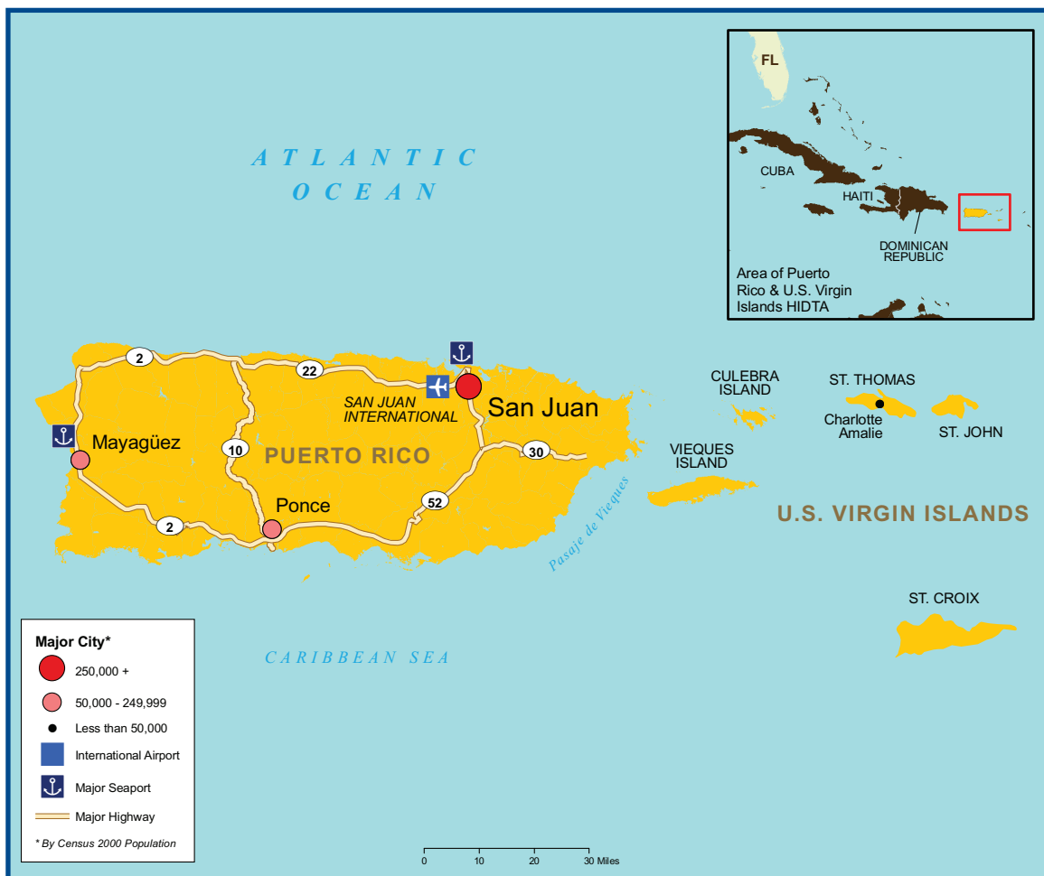
Figure 1. Puerto Rico/U.S. Virgin Islands High Intensity Drug Trafficking Area.

This assessment provides a strategic overview of the illicit drug situation in the Puerto Rico/U.S. Virgin Islands (PR/USVI) High Intensity Drug Trafficking Area (HIDTA), highlighting significant trends and law enforcement concerns related to the trafficking and abuse of illicit drugs. The report was prepared through detailed analysis of recent law enforcement reporting, information obtained through interviews with law enforcement and public health officials, and available statistical data. The report is designed to provide policymakers, resource planners, and law enforcement officials with a focused discussion of key drug issues and developments facing the PR/USVI HIDTA.