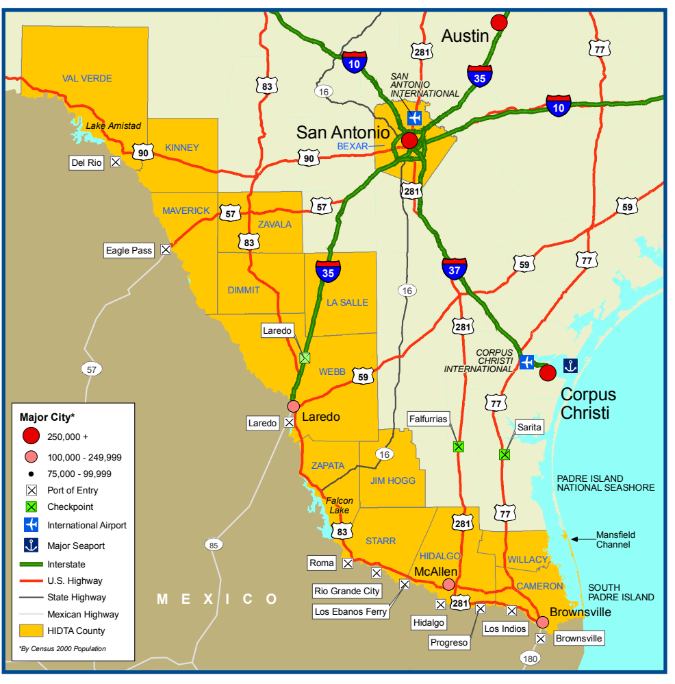
Figure 2. South Texas HIDTA region transportation infrastructure.

many Mexican DTOs are establishing cells in the city that specialize in drug transportation to other transportation and distribution centers in Texas and to drug markets in other regions of the United States. The highway network that supports San Antonio facilitates the movement of illicit drug shipments into and through the city. Most of the major roadways serving the area originate at the U.S.– Mexico border and connect with other roadways that serve drug markets throughout the country. (See Figure 2.) This transportation network also provides drug traffickers with various routes to transport bulk quantities of illicit drug proceeds to the South Texas border area and eventually into Mexico.