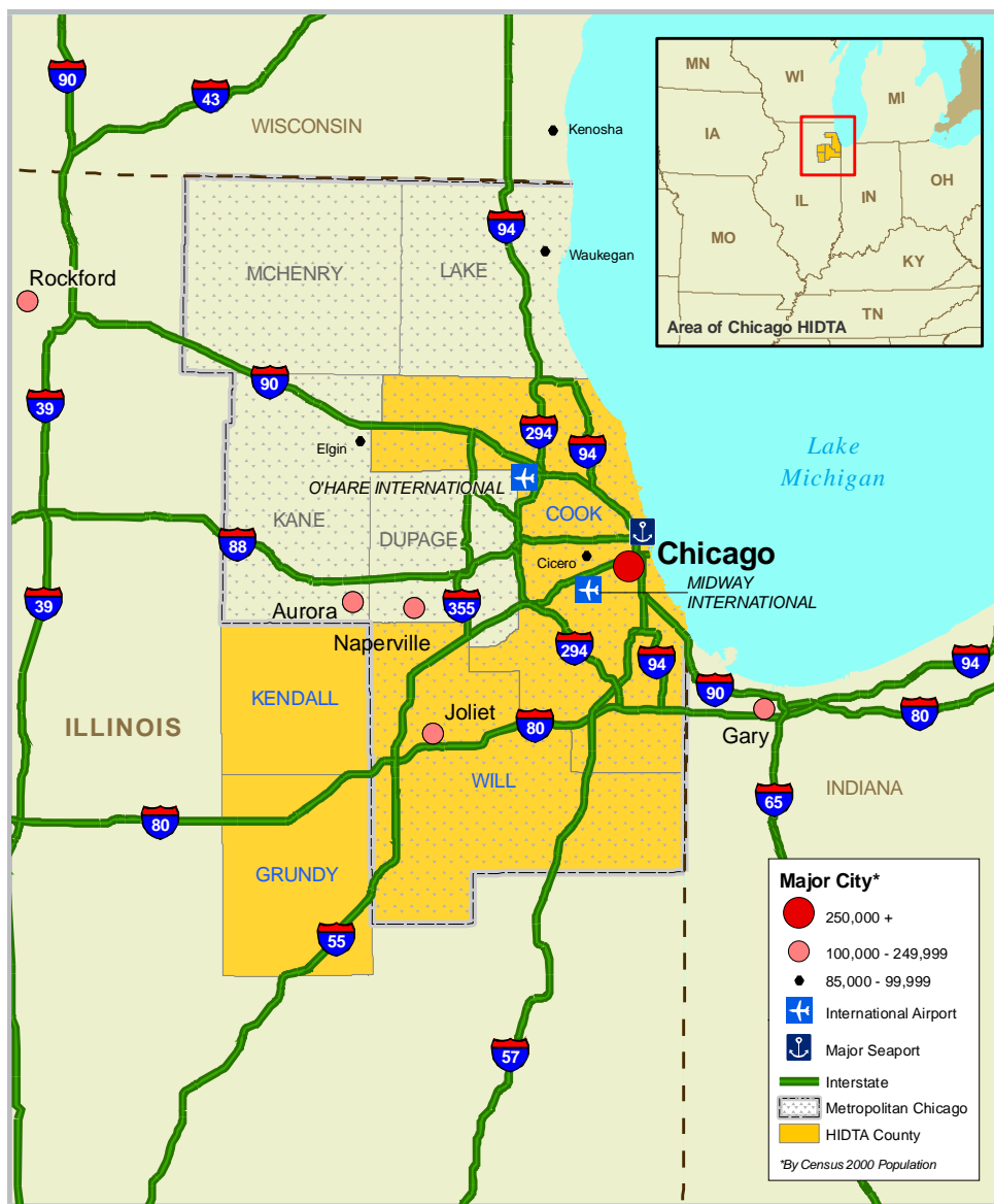
Figure 1. Chicago High Intensity Drug Trafficking Area

This assessment provides a strategic overview of the illicit drug situation in the Chicago High Intensity Drug Trafficking Area (HIDTA), highlighting significant trends and law enforcement concerns related to the trafficking and abuse of illicit drugs. The report was prepared through detailed analysis of recent law enforcement reporting, information obtained through interviews with law enforcement and public health officials, and available statistical data. The report is designed to provide policymakers, resource planners, and law enforcement officials with a focused discussion of key drug issues and developments facing the Chicago HIDTA.