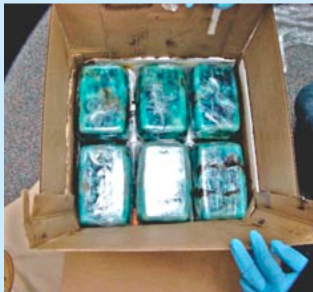
Photo of one of the boxes containing ice methamphetamine.

DEA officials with the Honolulu Airport Interdiction Task Force followed the packages through a controlled delivery and allowed the Federal Express employee to take possession of the boxes. The employee delivered them to a coconspirator at a local shopping center, and that individual took the boxes to a local residence, where a third male coconspirator opened the packages the next day. All three men were subsequently arrested. According to the U.S. Attorneys Office, District of Hawaii, this was the largest package seizure of methamphetamine in Hawaii in more than 20 years. The drugs had an estimated street value of $1.5 million.