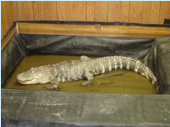
Cuyahoga County Sheriff's Office