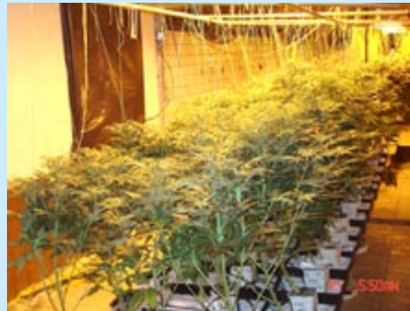
Cuyahoga County Sheriff's Office