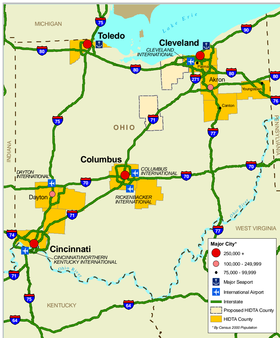
Figure 2. Ohio HIDTA Region Transportation Infrastructure

primarily use north-south highways such as Interstates 71, 75, and 77 and east-west highways such as Interstates 70 and 80/90 to transport illicit drugs from distribution centers along the Southwest Border. (See Figure 2.) Additionally, traffickers often conceal drug shipments in hidden compartments in private and commercial vehicles in an attempt to avoid detection by law enforcement officials. For example, in September 2008 the Greene County Agencies for Combined Enforcement discovered a hidden compartment in a vehicle after two small magnets were discovered on one of the suspects; the magnets were