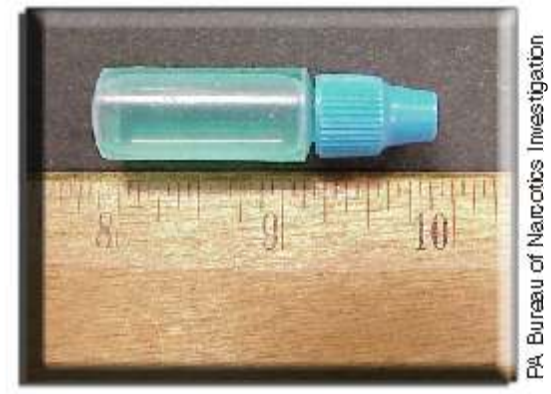
Bottle containing liquid LSD.

LSD generally is taken by mouth. The drug is colorless and odorless but has a slightly bitter taste.