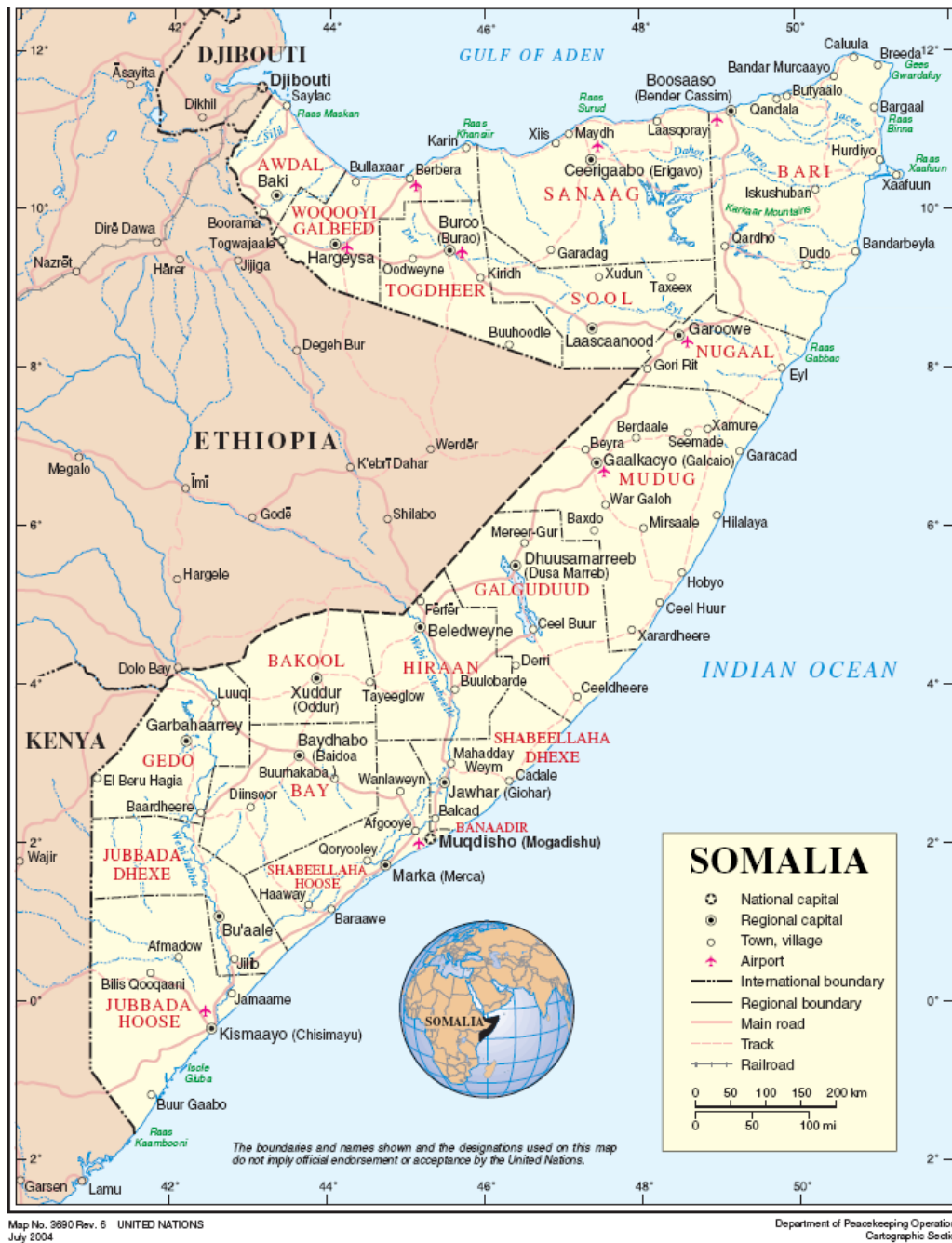
1.06 Map of Somalia, courtesy of the UN, June 2004.