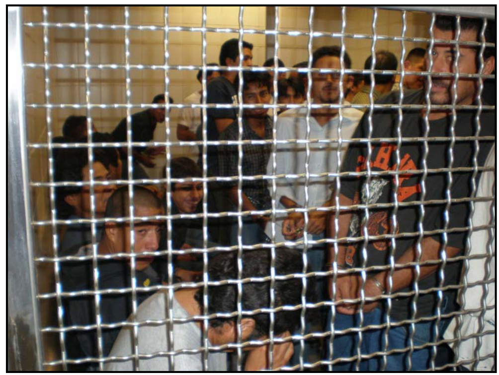
Detainees awaiting hearings stand shoulder-to-shoulder in the courthouse cellblock