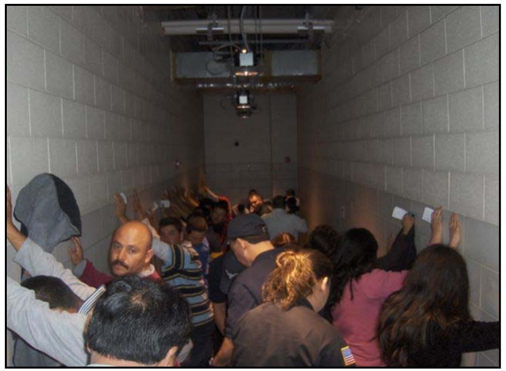
Searching prisoners is part of prisoner processing in a courthouse cellblock

The USMS has been forced to divert resources from fugitive apprehension activities and other mission areas in order to fill the gap which has resulted from increased judicial security in the courtrooms. In some cases, the sheer number of criminal aliens has overwhelmed courthouse cellblock capacity, creating untenable working conditions for Deputy Marshals.