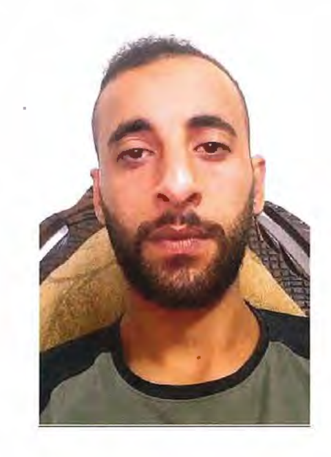
EXHIBIT B TO THE INDICTMENT

Forfeiture Allegations: (18 U.S.C. §§ 982(a)(2)(B) and 1030(i))