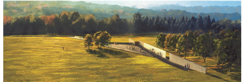
Flight 93 Memorial Design Plan