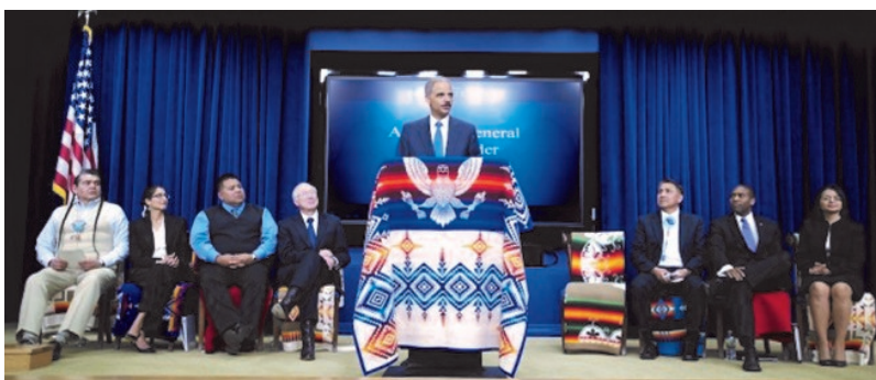
Attorney General Eric Holder announces the settlement of breach-of-trust lawsuits filed by more than 40 federally recognized American Indian tribes against the United States.

responsibilities include cases in virtually every United States district court of the Nation, its territories and possessions, the United States Court of Federal Claims, and in state courts. The subject matter involves federal land, resource and ecosystem management decisions challenged under a wide variety of federal environmental statutes and affecting more than a half-billion acres of lands managed by the Departments of the Interior and Agriculture (totaling nearly one-quarter of the entire land mass of the United States) and an additional 300 million acres of subsurface mineral interests; vital national security programs involving military preparedness and border protection, nuclear materials management, and weapons system research; billions of dollars in constitutional claims of Fifth Amendment takings covering a broad spectrum of federal activities affecting private property; challenges brought by individual Native Americans and Indian tribes relating to the United States' trust responsibility; a panoply of cultural resource matters including cases related to historic buildings, repatriation of ancient human remains and salvage of shipwrecks; preserving federal water rights and prosecuting water rights adjudications; ensuring proper mineral royalty payments to the Treasury; and litigation involving offshore boundary disputes, interstate water