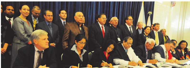
Federal officials and Tribal leaders commemorate the final settlement of historic trust accounting and trust management claims.

The Division also defends claims brought by tribes. Under settlements reached in the spring of 2012, the United States will pay a total of more than $1 billion to 41 tribes in compensation of the tribes’ claims regarding the government’s management of trust funds and non-monetary trust resources. And in October 2011, the Osage Tribe and the United States agreed to a historic settlement of the tribe’s claims for $380 million.