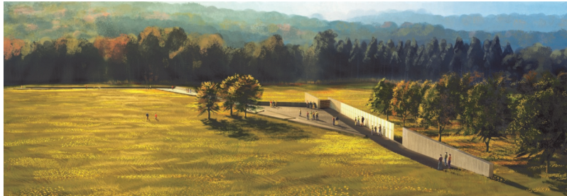
Flight 93 Memorial Design Plan