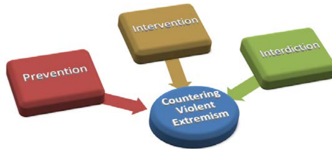
Figure 1: Los Angeles CVE Framework Overview