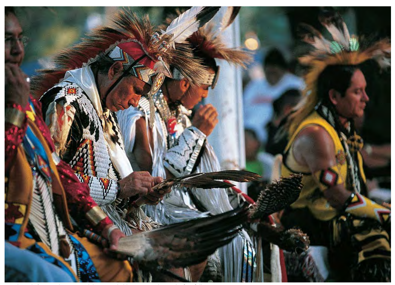
Omaha Tribe's Annual Harvest Celebration is held every year during the first full moon in August.