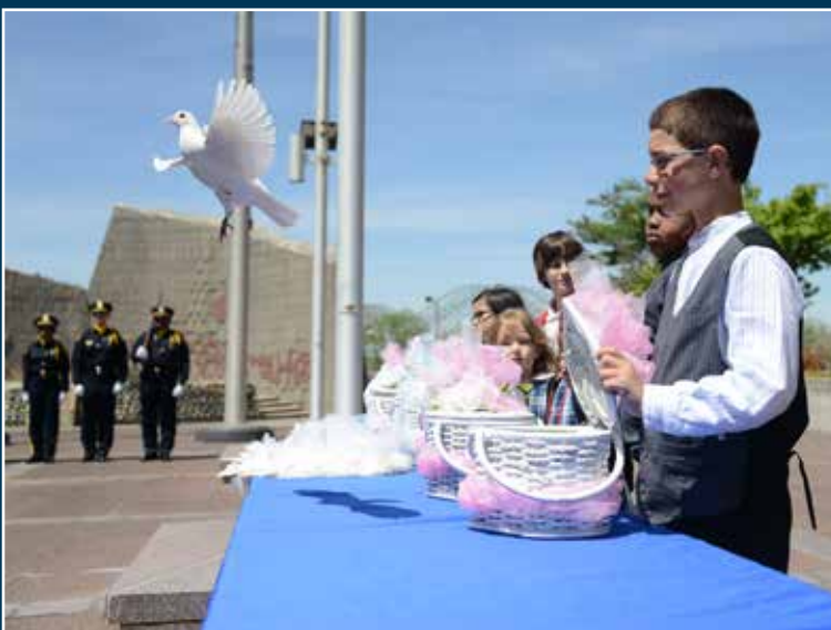
The U.S. Attorney’s Office attended the annual Children’s Memorial Flag Raising, sponsored by the Child Advocacy Center. As part of the ceremony, a white dove is released in memory of each child who died during the previous year as a result of child abuse or neglect.