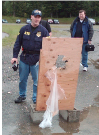
Left: Tennis ball bombs seized from Mr. Pablo; Right: hole blown through plywood by one tennis ball bomb (ATF demo, 5/27/2010)

The “Thunder & Diamonds” launch tubes look cosmetically similar to legal consumer fireworks, but again are substantially more powerful and dangerous. They contain much more explosive material than a similar consumer-grade launch tube. They also contain a projectile shell made out of hard plastic instead of cardboard, which could easily injure a bystander if it exploded nearby.