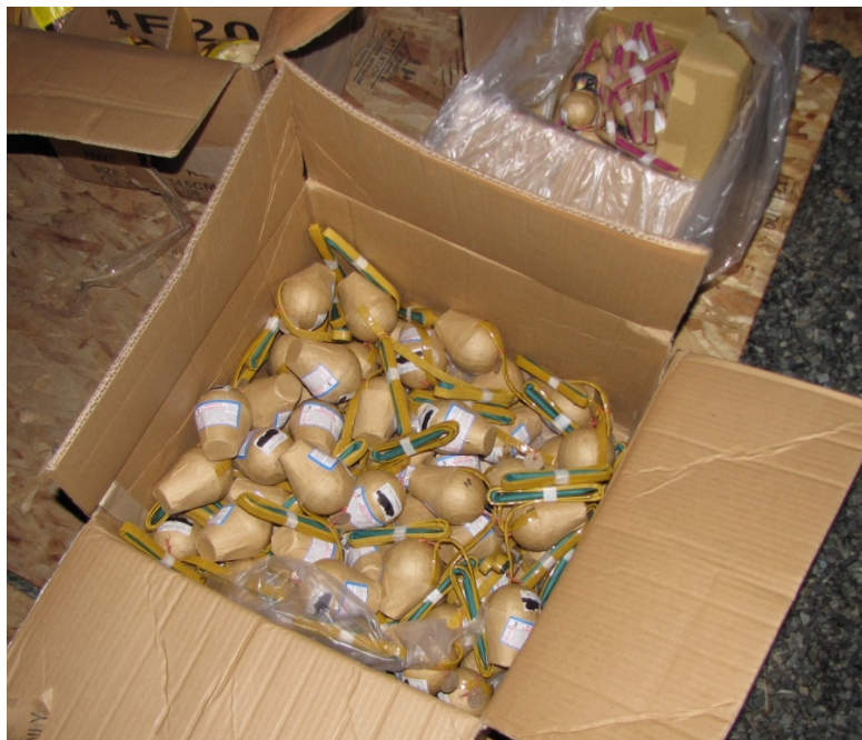
Some of the additional display shells discovered in the nearby storage container; the box in the foreground contains more than 3 dozen of the 3" shells