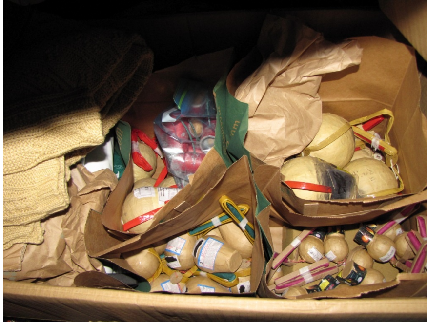
Assorted 2" to 5" commercial display shells, some with safety warnings obliterated, as discovered in a box underneath the front counter of Mr. Pablo's stand