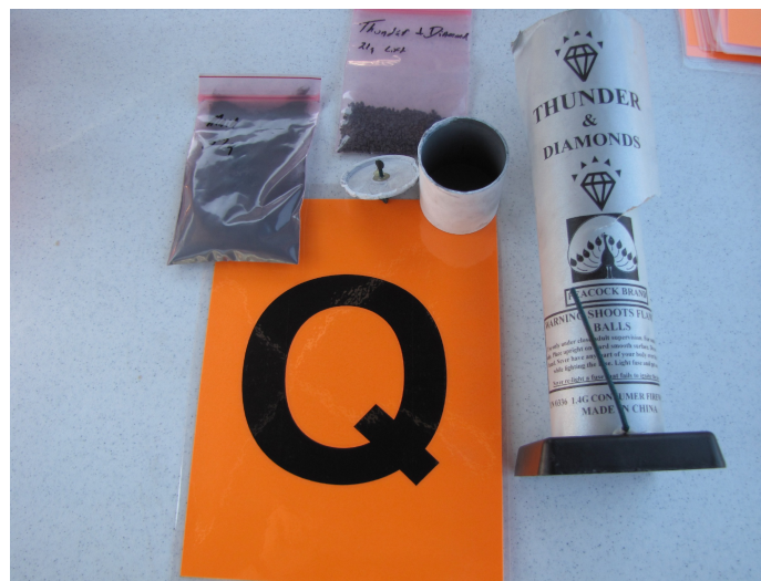
Disassembled “Thunder & Diamonds” tube, showing components including hard plastic projectile shell (at top right corner of orange card)

The “Thunder & Diamonds” launch tubes look cosmetically similar to legal consumer fireworks, but again are substantially more powerful and dangerous. They contain much more explosive material than a similar consumer-grade launch tube. They also contain a projectile shell made out of hard plastic instead of cardboard, which could easily injure a bystander if it exploded nearby.