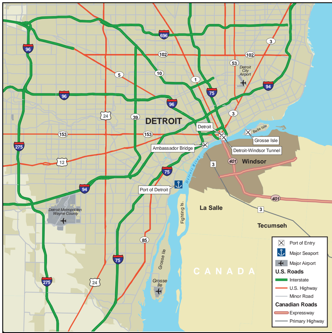
Figure 2. International border between Detroit, Michigan, and Windsor, Ontario.

throughout Michigan and several other states, including Georgia, Kentucky, Ohio, Pennsylvania, and West Virginia.