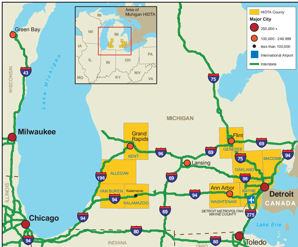
Figure 1. Michigan High Intensity Drug Trafficking Area.

recent law enforcement reporting, information obtained through interviews with law enforcement and public health officials, and available statistical data. The report is designed to provide policymakers, resource planners, and law enforcement officials with a focused discussion of key drug issues and developments facing the Michigan HIDTA region.