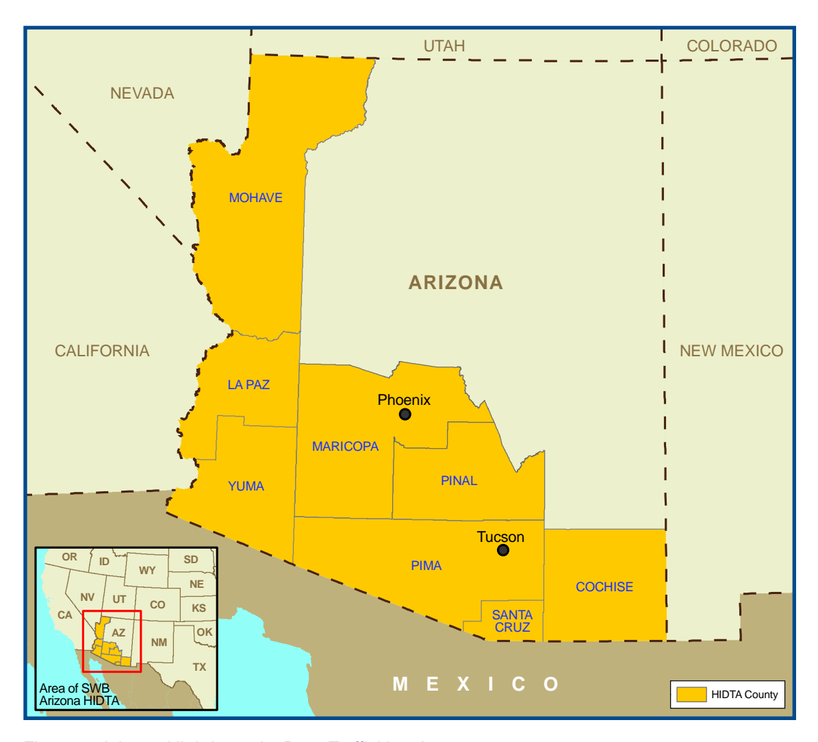
Figure 1. Arizona High Intensity Drug Trafficking Area.

This assessment provides a strategic overview of the illicit drug situation in the Arizona High Intensity Drug Trafficking Area (HIDTA), highlighting significant trends and law enforcement concerns related to the trafficking and abuse of illicit drugs. The report was prepared through detailed analysis of recent law enforcement reporting, information obtained through interviews with law enforcement and public health officials, and available statistical data. The report is designed to provide policymakers, resource planners, and law enforcement officials with a focused discussion of key drug issues and developments facing the Arizona HIDTA.