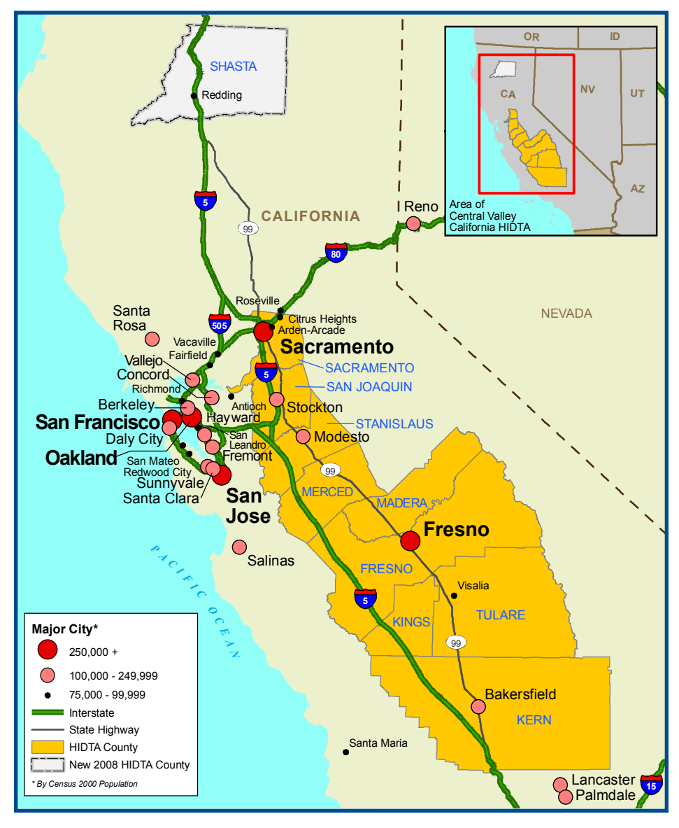
Figure 1. Central Valley California High Intensity Drug Trafficking Area.

This assessment provides a strategic overview of the illicit drug situation in the Central Valley California (CVC) High Intensity Drug Trafficking Area (HIDTA), highlighting significant trends and law enforcement concerns related to the trafficking and abuse of illicit drugs. The report was prepared through detailed analysis of recent law enforcement reporting, information obtained through interviews with law enforcement and public health officials, and available statistical data. The report is designed to provide policymakers, resource planners, and law enforcement officials with a focused discussion of key drug issues and developments facing the Central Valley California HIDTA.