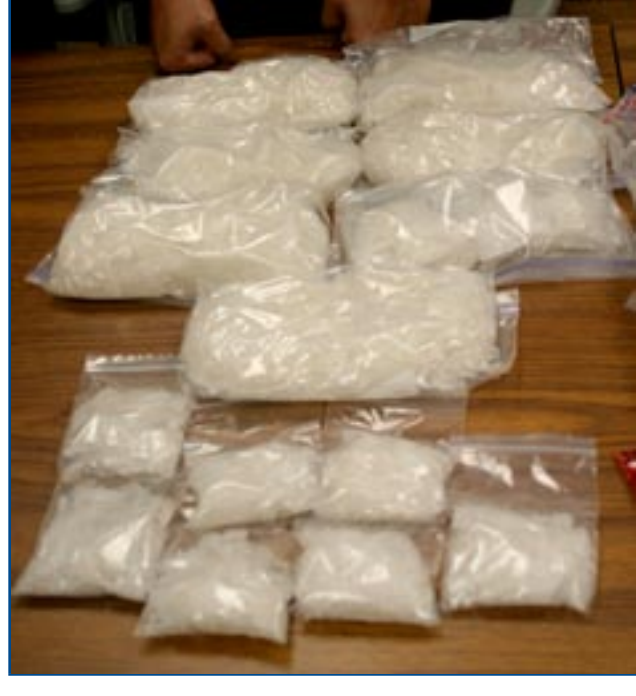
Figure 2. Mexican ice methamphetamine seized on the Big Island in 2007.