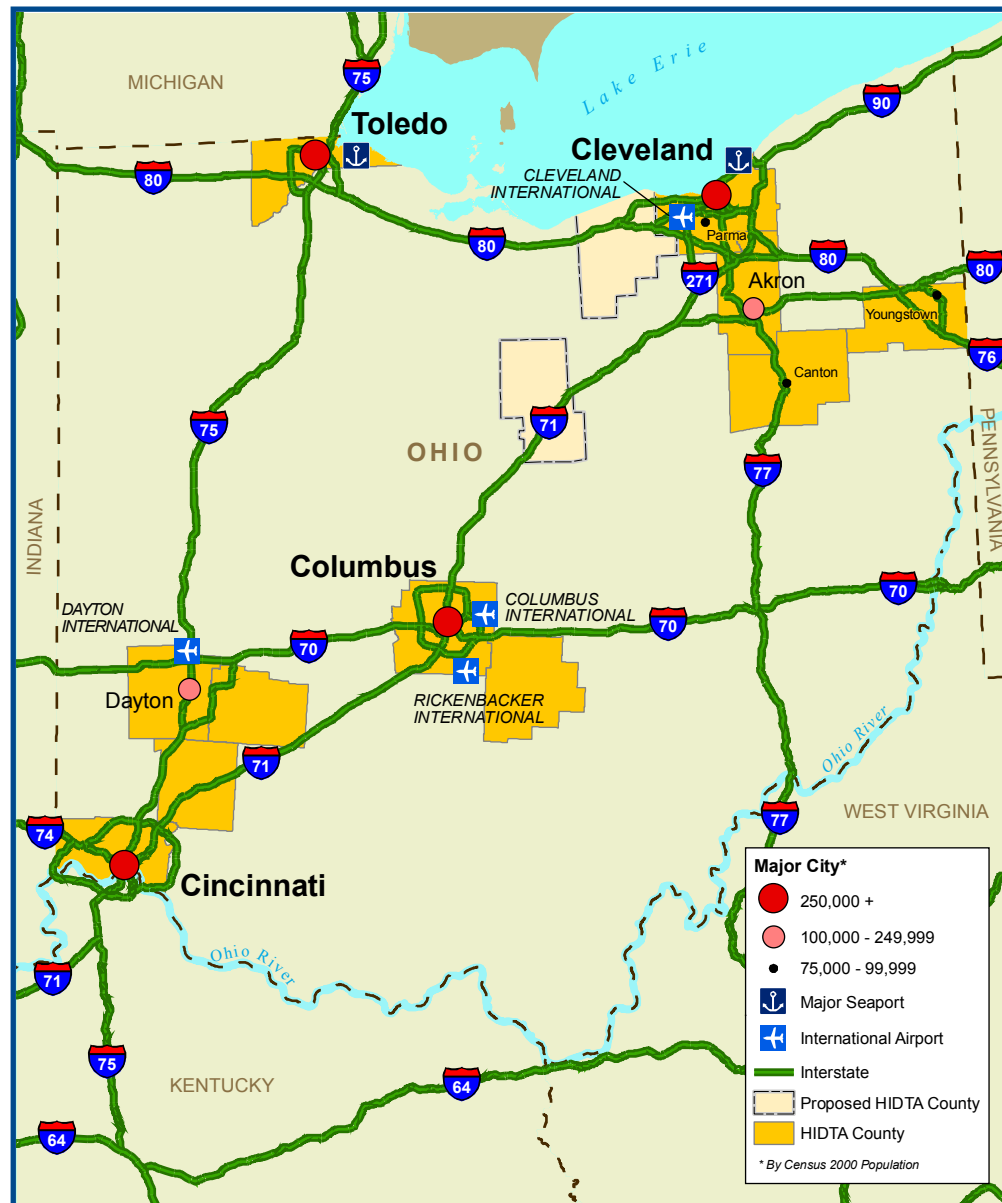
Figure 2. Ohio HIDTA region transportation infrastructure.

levels. Mexican traffickers have also replaced African American criminal groups as the primary wholesale-level distributors of cocaine, marijuana, and heroin in Dayton. The overall availability of heroin in Dayton has increased significantly; law enforcement officials report that prior to the recent influx of Mexican heroin, kilogram quantities of heroin were not available in the city.