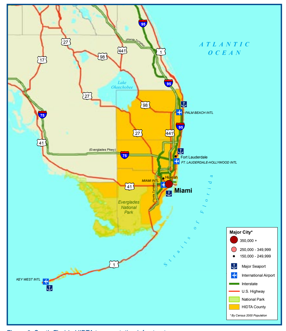
Figure 2. South Florida HIDTA transportation infrastructure.