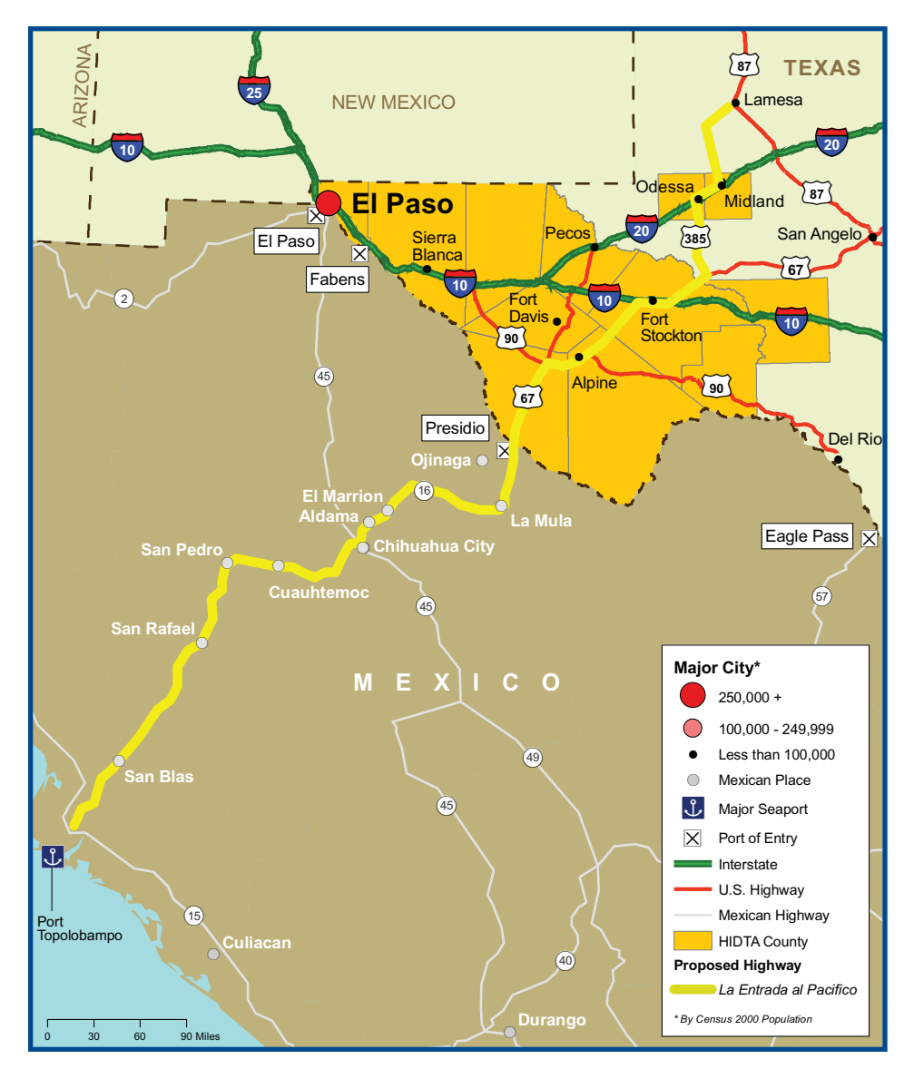
Figure 2. La Entrada al Pacifico.

Mexican Government has switched its emphasis to a new border road project that would construct a highway from Presidio to Del Rio as well as all along Mexico's northern border. Construction of this roadway will give DTOs better access to long stretches of the border where currently there are only rough or nonexistent roads.