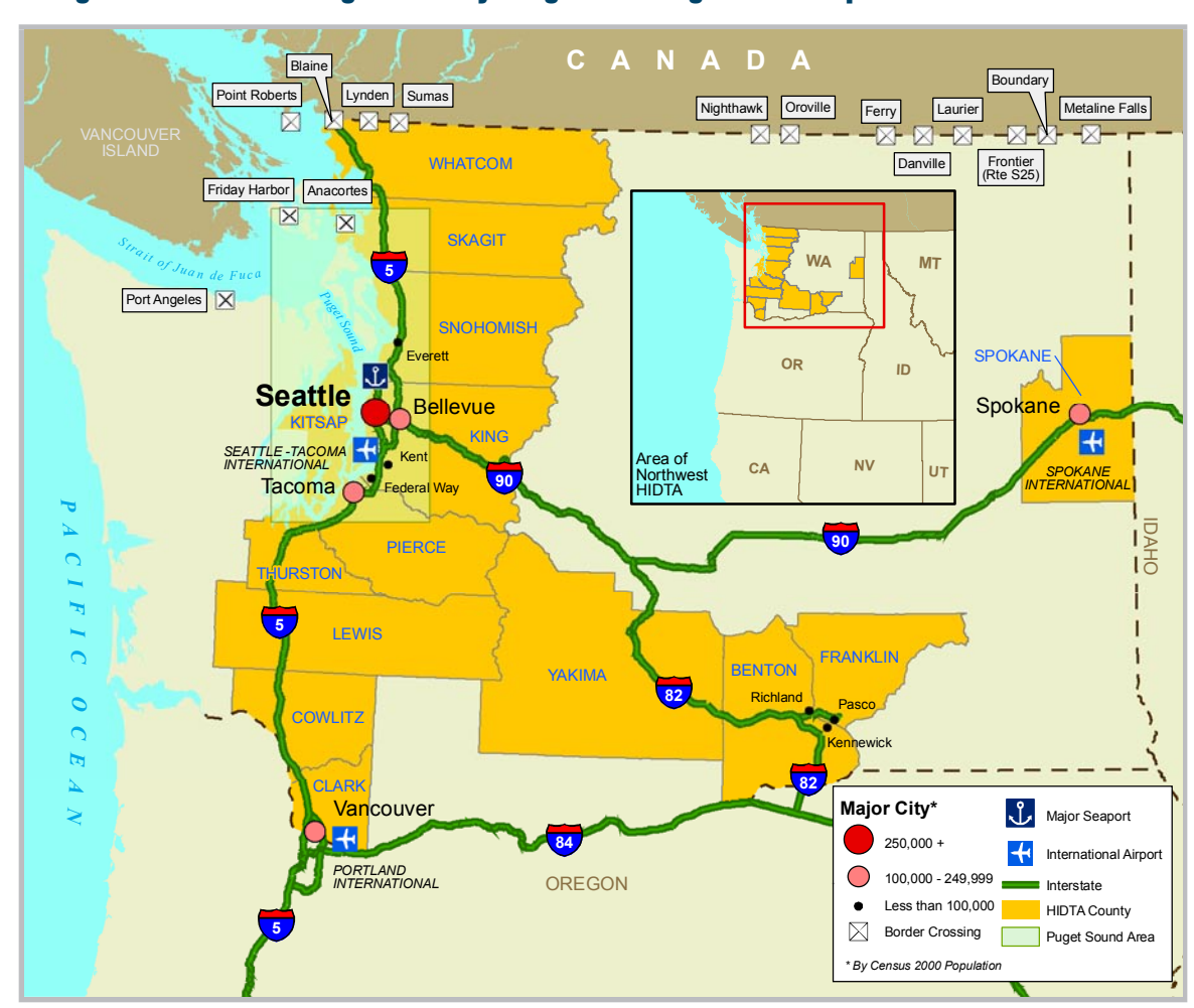
Figure 1. Northwest High Intensity Drug Trafficking Area transportation infrastructure.

This assessment provides a strategic overview of the illicit drug situation in the Northwest High Intensity Drug Trafficking Area (HIDTA), highlighting significant trends and law enforcement concerns related to the trafficking and abuse of illicit drugs. The report was prepared through detailed analysis of recent law enforcement reporting, information obtained through interviews with law enforcement and public health officials, and available statistical data. The report is designed to provide policymakers, resource planners, and law enforcement officials with a focused discussion of key drug issues and developments facing the Northwest HIDTA.