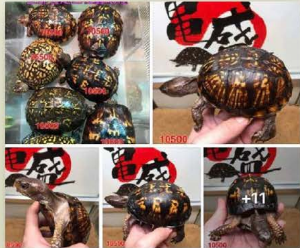
Turtles posted for sale on Freeman's Facebook Page

One day following the purchase, a diver notified Alaska state officials that he mistakenly harvested geoduck from an area not tested for paralytic shellfish poisoning. An