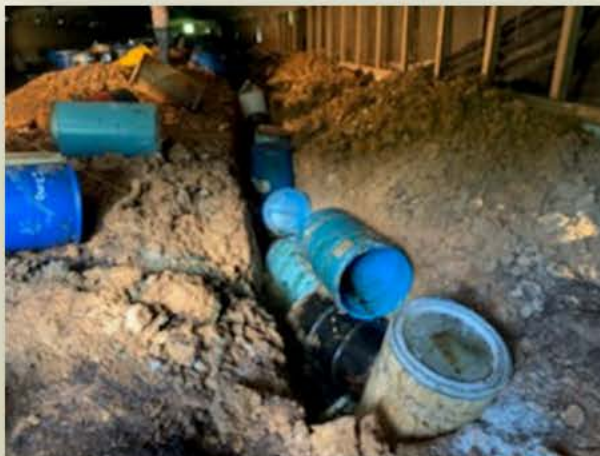
Drums dumped inside chicken house