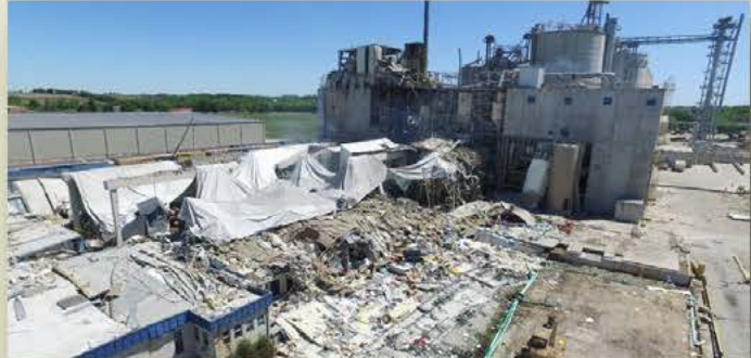
Mill following the explosion

The U.S. Environmental Protection Agency Criminal Investigation Division conducted the investigation.