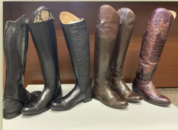
Boots made with exotic wildlife trim

The U.S. Fish and Wildlife Service and Environment Canada Wildlife Enforcement Division conducted the investigation.