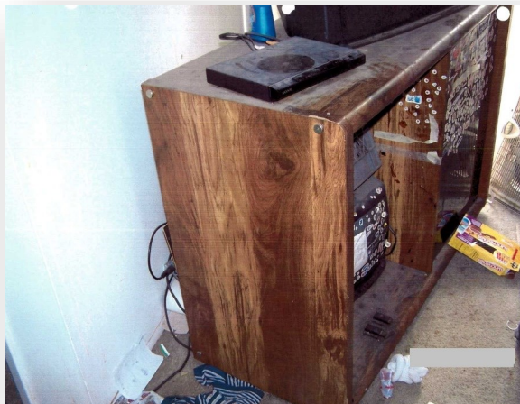
Asbestos –contaminated dust in an apartment that was evacuated

In early 2014, the Overlook at Mile High Apartment Complex underwent renovations. WillMax hired A&A Hauling and Concrete to sand asbestos-containing mastic glue off of concrete floors located in the common areas. The complex is comprised of multiple towers, each with approximately 50