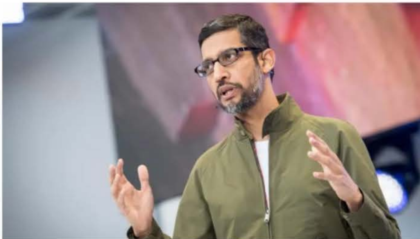
Sundar Pichai, chief executive officer of Google Inc., speaks during the Google I/O Developers Conference in Mountain View, California, U.S., on Tuesday, May 8, 2018.

Follow your favorite stocks CREATE FREE ACCOUNT