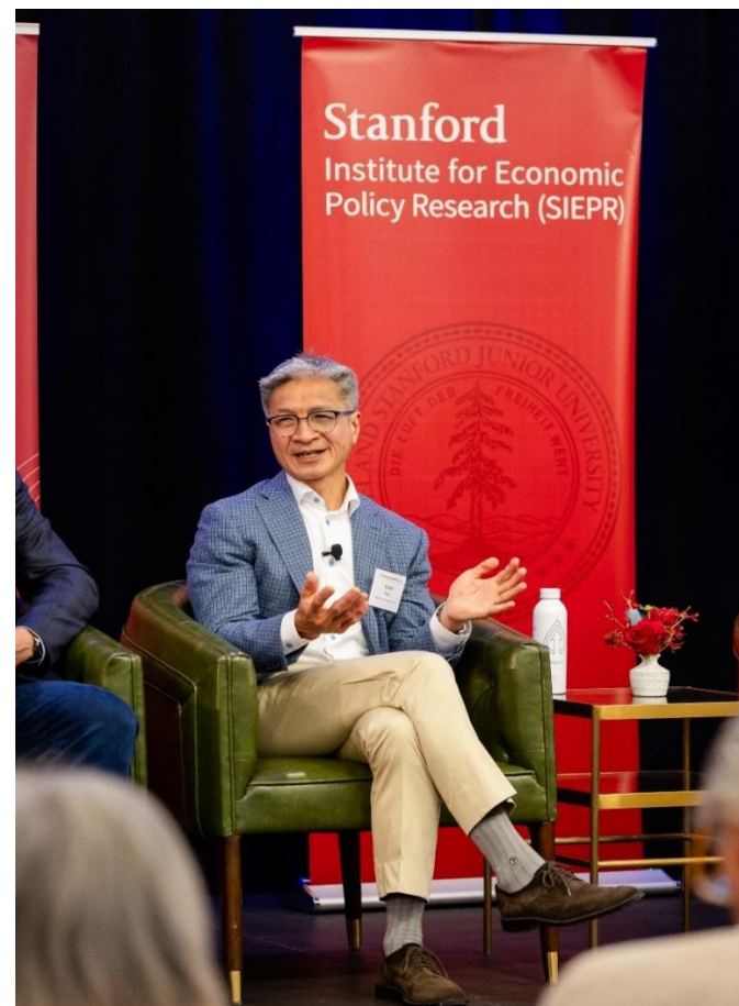
Victor Peng discusses competition in AI-enabled chips and how this market operates.