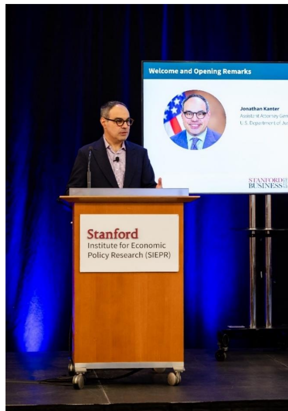
Assistant Attorney General Jonathan Kanter addresses those in attendance at the workshop.

If you have any information on anticompetitive activity in the AI ecosystem, please contact the Antitrust Division's Complaint Center .