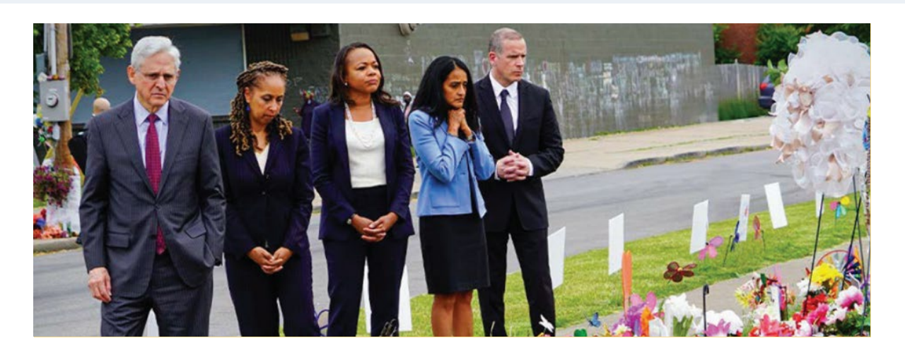
Senior Justice Department leadership at a memorial for victims and survivors of the May 14, 2022, attack in Buffalo, New York.