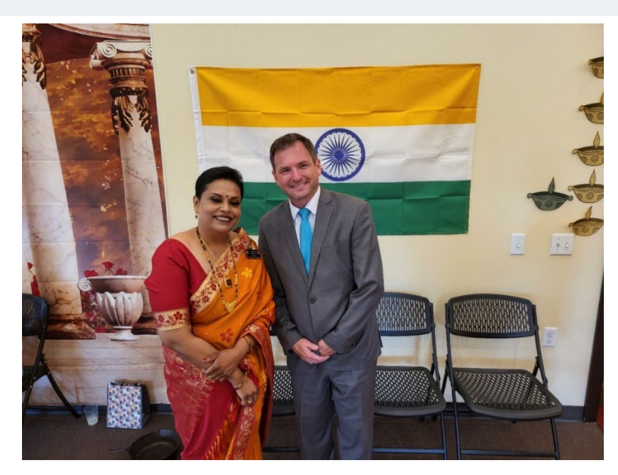
The U.S. Attorneys' Office in South Dakota hosted a United Against Hate event at the Hindu Temple of Siouxland.

The United Against Hate program covers a range of topics, including: