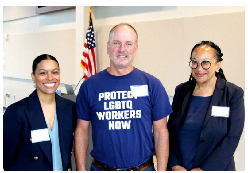
The U.S. Attorneys' Office for the Northern District of Georgia hosted a series of United Against Hate events with communities across their district.