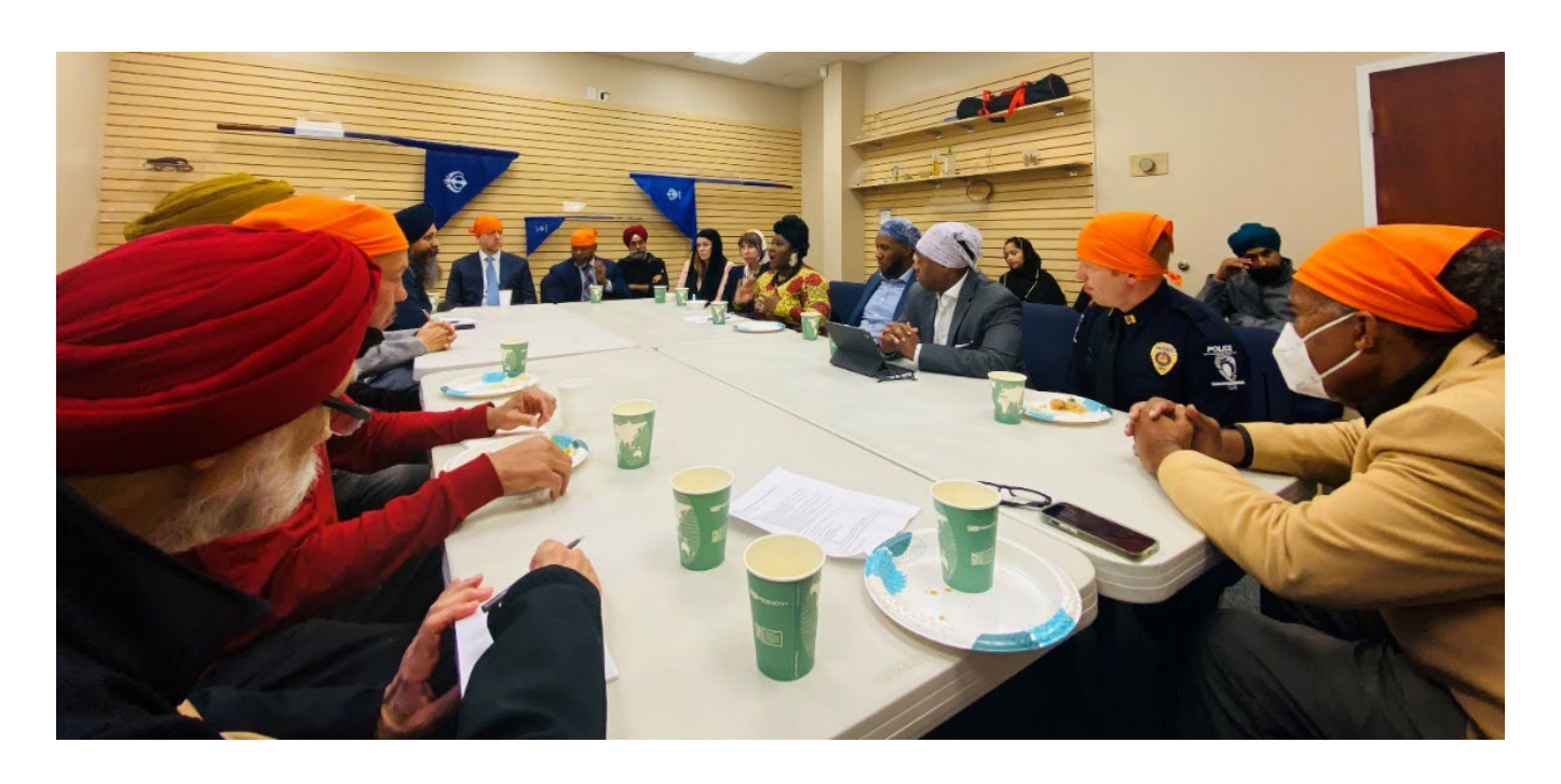
The U.S. Attorneys' Office for the Western District of North Carolina and law enforcement officials met with representatives from the Sikh Community at the Gurdwara Khalsa Darbar in Charlotte.