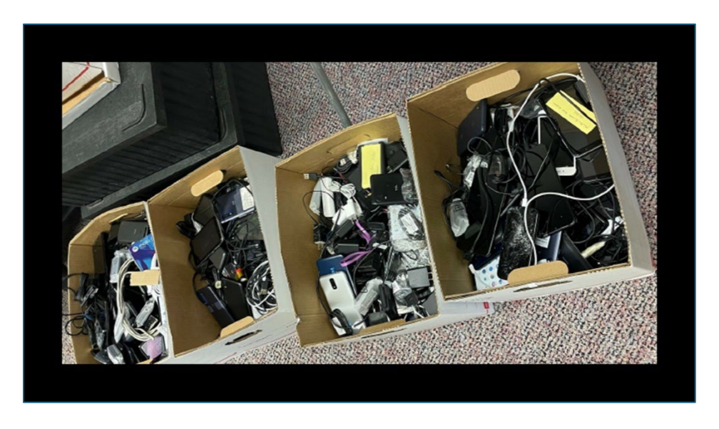
Boxes of contraband cell phones and cell phone chargers collected at ASGDC

Understanding how contraband enters the facility is critical to preventing it from entering the facility again. Yet in numerous contraband incidents we reviewed, there is no evidence that ASGDC staff investigated how the contraband entered the facility or conducted additional searches in the days and weeks following the incident to ensure contraband was not immediately reintroduced. In one instance, an ASGDC investigator told DOJ about an ASGDC employee who had been caught attempting to bring contraband into the facility. The contraband was not seized because the worker was allowed to leave the building due to a miscommunication between staff and security. ASGDC's efforts to address contraband are not working because it does not follow its own policies or effectively use its screening tools.