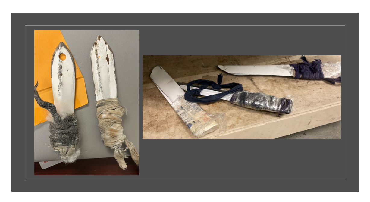
Weapons recovered at ASGDC

We also found several instances where incarcerated people were able to bring in, hide, or manufacture contraband due to disrepair in the facility, such as holes in the ceiling. In July 2023, for example, an officer observed an incarcerated person going through an opening in the ceiling of a housing unit using a stack of chairs. Another officer found several packages of contraband that had been thrown over the Jail's security fence, presumably for an individual to retrieve and take into the Jail. The same month, staff found the following stashed in a ceiling: 15 metal objects that could be used as weapons, one roll of duct tape, three knives, one hair clipper, one roll of plastic wrap, three green leafy substances, and one phone charger. And, in December 2023, an officer observed an incarcerated man using a weapon like a screwdriver to open ceiling lights at the center of the room. The officer confiscated the weapon and retrieved from the ceiling, among other items, a long street knife, phones and phone accessories, and bags of leafy substances that could have been drugs.