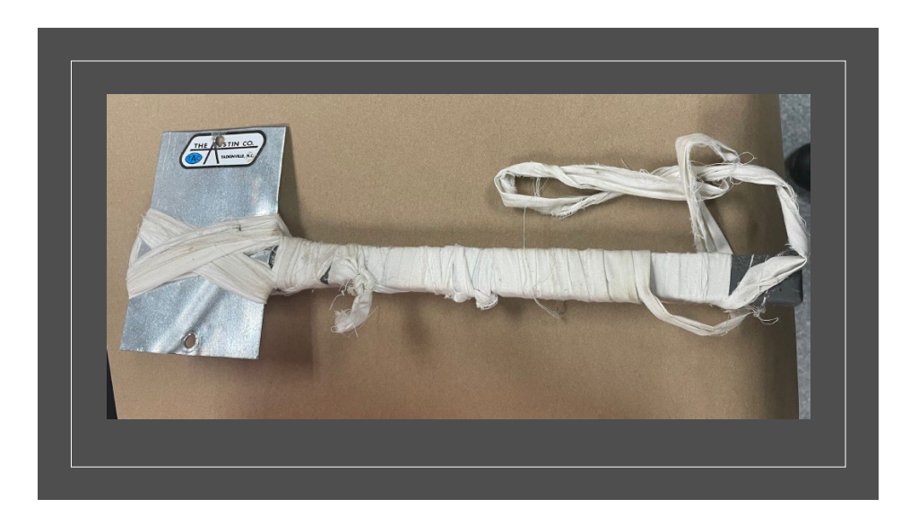
Handmade axe used in January 2024 incident seized at ASGDC

While ASGDC's policies require a chain of custody for contraband related to a criminal action or disciplinary sanction that records the name of the accused, the type of contraband, the date, time, and place it was discovered, and the person who discovered it, ASGDC has not been maintaining a chain of custody or marking contraband with this information. In one incident, an officer transported an incarcerated person to the hospital where she recovered a blade. Rather than handling the contraband weapon as evidence and preparing a chain of custody, she "wrapped it in a tissue and threw it in the trash." Similarly, in January 2024, two incarcerated people sustained serious injuries that required hospitalization after attacking each other with "large cutting instruments," one of which was described as a "large axe." The axe was not secured by the ASGDC officer and was instead found by the Sheriff's Department wrapped in a towel in the trash can.