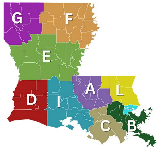
LSP has ten troops that patrol different parishes around the state.

LSP also has several statewide units. The Criminal Investigations Division (CID) investigates crimes around the state. The Force Investigation Unit (FIU) investigates serious uses of force by LSP troopers. LSP's Internal Affairs (IA) unit is responsible for investigating potential policy violations by troopers and civilian law enforcement professionals.