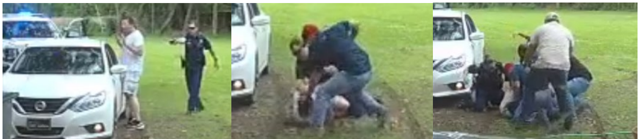
Following a pursuit, LSP tased a man in the back while he was facing a car with his hands up. Five troopers piled on him and punched him repeatedly. When placing the man in a patrol car, a trooper told him, “You’re a piece of shit. You’re a first-rate piece of fucking shit.”

For example, troopers tased a man in the back while he was standing with his hands in the air and then beat him with their fists, apparently in retaliation for attempting to evade capture. Four days before the incident, a female trooper had tried to arrest the man during a traffic stop, but he fled and escaped. When troopers later went to the man’s home with an arrest warrant, he again fled in his vehicle. When the vehicle finally stopped in a residential yard, the man got out of the car and turned to face it with his hands up. An LSP trooper tased him in the back. Five troopers, including some in plain clothes, then pinned him down, tasing him and punching him more than 20 times in his head and body, even though he was restrained, unarmed, and did not appear to be resisting. One of the troopers grabbed the man’s head and slammed it into the ground. Another trooper held his head down in the dirt for approximately 20 seconds. After the many uses of force, when placing the man in a patrol car, a trooper told him, “You’re a piece of shit. You’re a first-rate piece of fucking shit . . . You want to try to run and fight a fucking girl.”