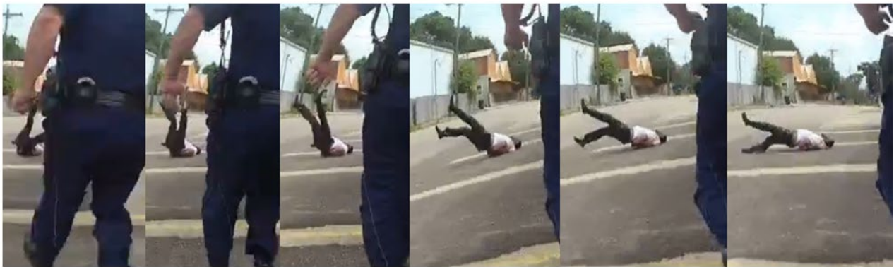
A handcuffed man with no way to break his fall slams into the pavement after being tased.

In another incident, an LSP trooper tased an unarmed man after pulling him over for not signaling while changing lanes, not wearing a seatbelt, and having a fake vehicle inspection sticker. The man was handcuffed and shoeless at the time. After pulling up a picture of the person to whom the car was registered, the troopers became suspicious as they did not believe the driver resembled the owner of the vehicle. When asked, the driver did not produce a driver's license and hesitated when providing his date of birth. Before he could finish answering the trooper's question, troopers grabbed the man, handcuffed, and searched him. As the troopers were walking the man to a patrol car, he attempted to run. All three troopers who were on the scene chased after him. Within six seconds, a trooper tased the man. Unable to break his fall, he fell backwards onto the pavement, hitting his head and back and cutting his elbow so severely he needed stitches.