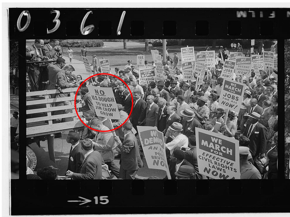
At the March on Washington for Jobs and Freedom, on August 28, 1963, a demonstrator carries a placard calling for the passage of Title VI, " No U.S. Dough to Help Jim Crow Grow. "

In 1964, after years of intensive work on the part of civil rights advocates and their supporters in Congress, President Lyndon B. Johnson signed the landmark Civil Rights Act of 1964. Included among the Civil Rights Act's eleven titles is Title VI, codified at 42 U.S.C. § 2000d et seq. In 1963, President John F. Kennedy explained the need for Title VI: "Direct discrimination by Federal, State, or local governments is prohibited by the Constitution. But indirect discrimination, through the use of Federal funds, is just as invidious." Title VI directly addresses the then-common practice of denying certain persons access to federally funded services, programs, and activities based on their race, color, or national origin.