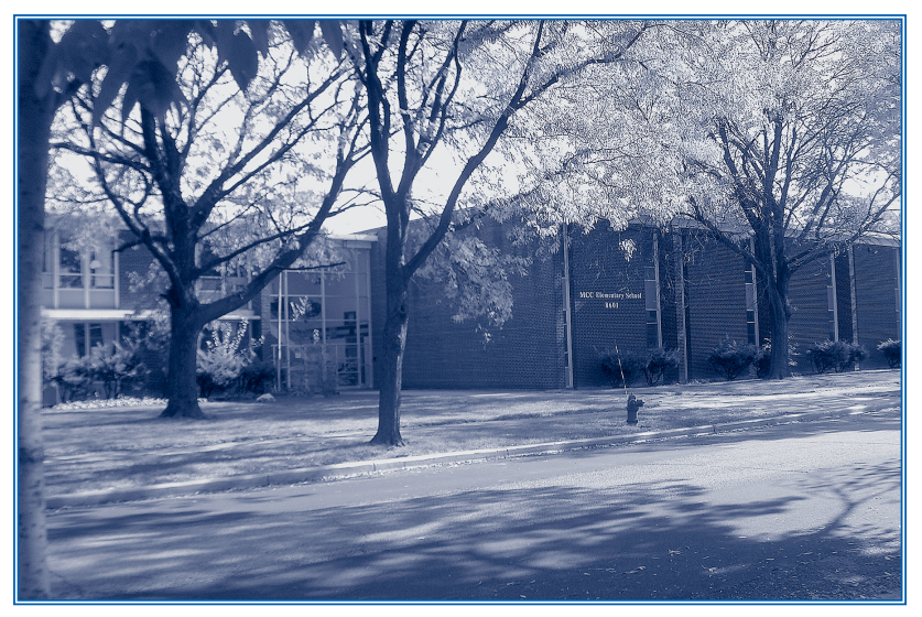
The Muslim Community Center in Morton Grove, Illinois, which reached an agreement with the city to build a mosque with the help of Department of Justice mediators.

Similarly, a Muslim school in Morton Grove, Illinois encountered community opposition to its plans to build a mosque