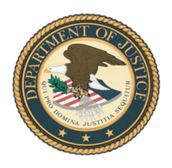
U.S. Department of Justice