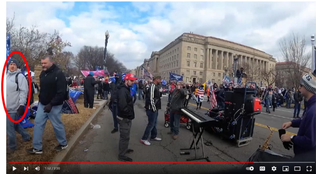
DC Pre Rally