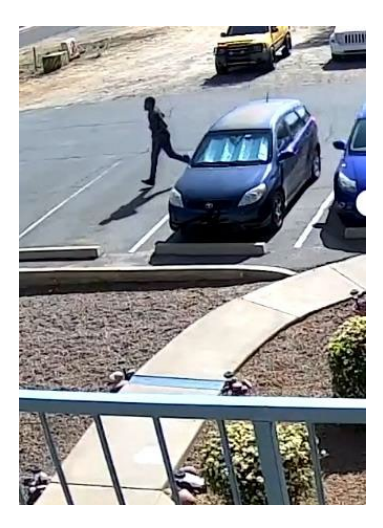
Doc. 24, at 5.