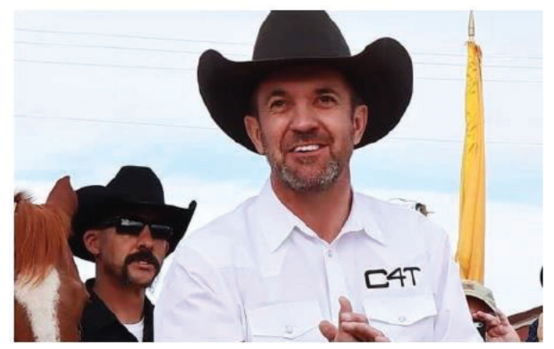
Conv Griffin is an Otero County Commissioner and founder of "Cowboys for Trump"

Based on the foregoing, your affiant submits that there is probable cause to believe that COUY GRIFFIN violated 18 U.S.C. § 1752(a), which makes it a crime to (1) knowingly enter or remain in any restricted building or grounds without lawful authority to do; and (2) knowingly, and with intent to impede or disrupt the orderly conduct of Government business or official functions, engage in disorderly or disruptive conduct in, or within such proximity to, any restricted building or grounds when, or so that, such conduct, in fact, impedes or disrupts the orderly conduct of Government business or official functions.