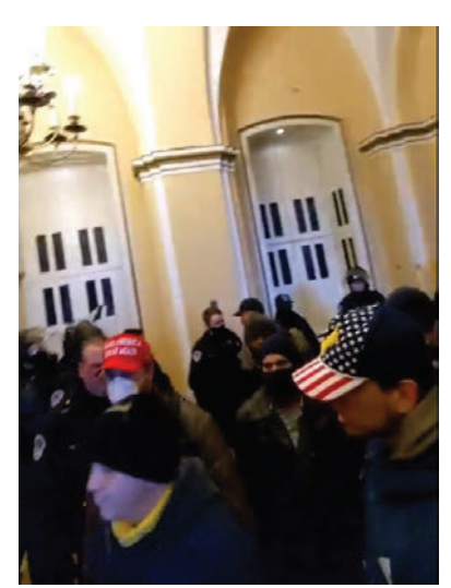
Image 13: Still image of video of travel through Senate Wing Corridor

These images correspond to Ondulich's location as observed on Capitol surveillance footage. In another conversation on Instagram on January 7, 2021, Ondulich wrote: