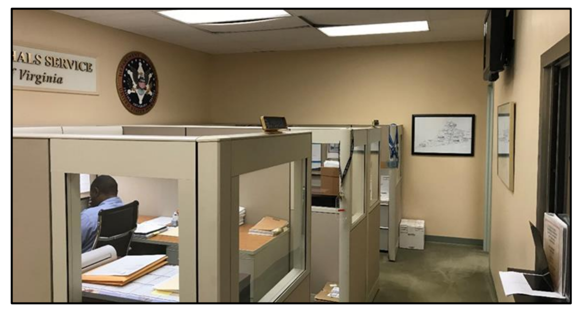
Before construction: administrative area.