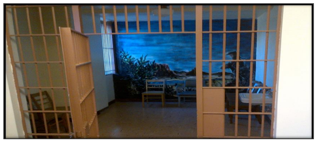
Outdated prisoner holding cell, built in the 1930's. Wooden chairs, porcelain plumbing fixtures, and glass light fixture are not maximum security and could be used as weapons.

The unsecured furnishings found in older holding cells can easily be fashioned into weapons which could be introduced into the courtroom environment or used to assault USMS personnel or other prisoners. Older lighting fixtures provide a ready source of glass for weapons, or an attachment point for a suicide attempt. Painted furniture and walls offer opportunities to scratch graffiti and messages to other prisoners. Cells constructed in compliance with Publication 64 standards do not have these shortcomings.