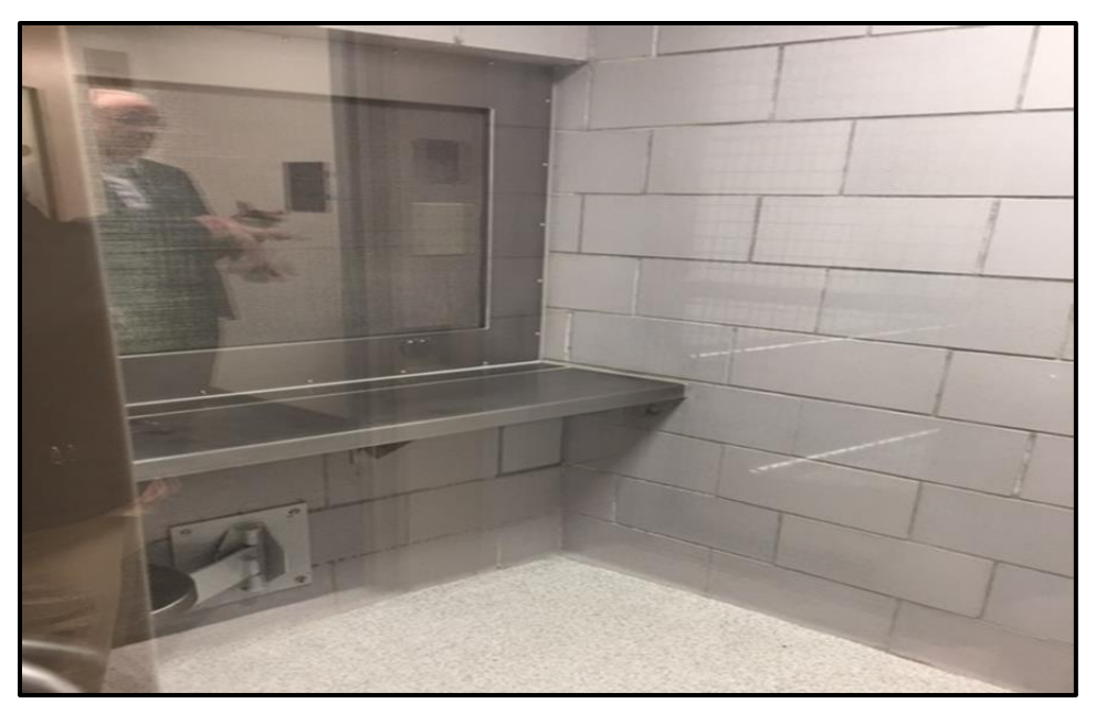
Prisoner/Attorney interview room constructed to current USMS standards.