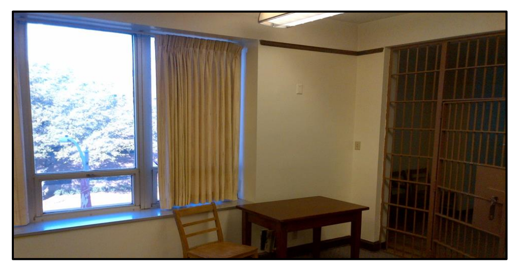
Outdated and non-secure prisoner/attorney interview room.

Interview rooms that are not sight- and sound-isolated from holding cells may allow other prisoners and law enforcement personnel to overhear privileged conversations, and extra measures (such as removing prisoners from a cellblock) must be taken to mitigate this risk. Interview rooms that provide multiple egress points for prisoners present a risk for escape.