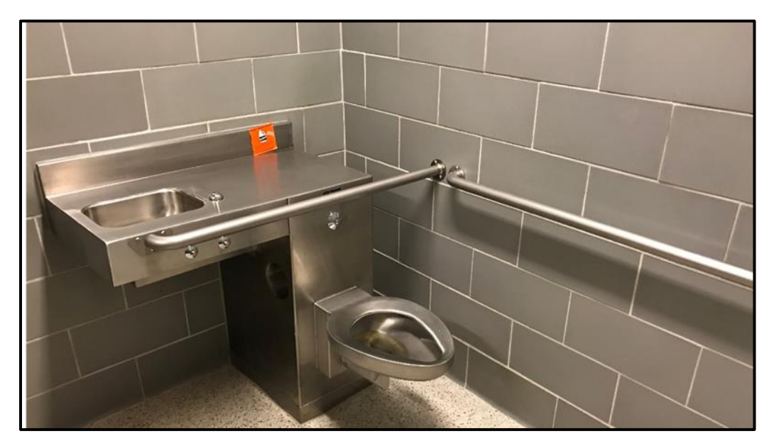
Finished product: accessible prisoner toilet.