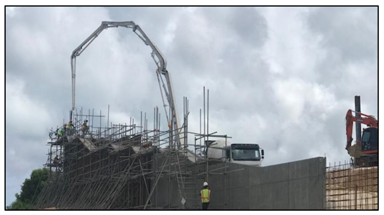
New U.S. Courthouse under construction.