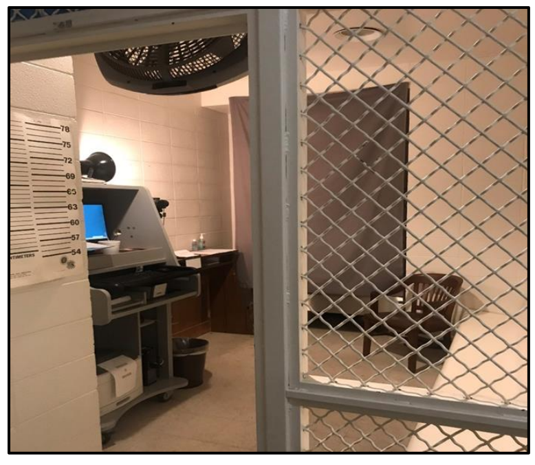
Prisoner processing prior to renovation.