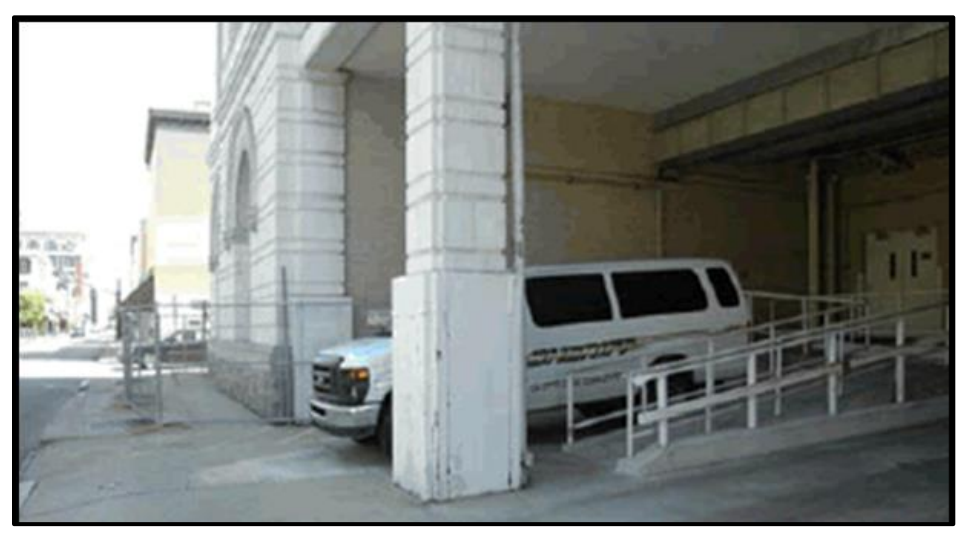
Non-standard sallyport: Open access to prisoner movement, fence blocking sidewalk.

Prisoner transport vehicles enter the courthouse through the vehicle sallyport, the first point of entry into the building's secure movement system. Sallyports are used exclusively by the USMS. Publication 64 articulates standards for vehicle sallyport size, which is determined by the types of vehicle (automobiles, vans, buses, minibuses, or combinations thereof) that meet district office requirements as well as the district's current or anticipated prisoner vehicle fleet. Sallyports that fail to meet the security standards set forth in Publication 64 jeopardize public safety by increasing the risk of escape, and present a security threat to both USMS deputies and prisoners.