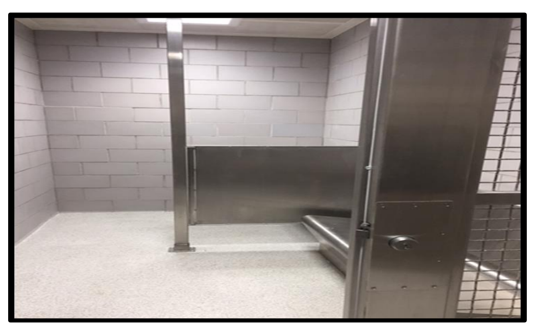
USMS prisoner holding cell constructed to current standards.