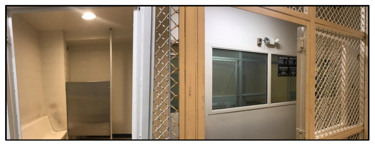
Cellblock prior to renovation.