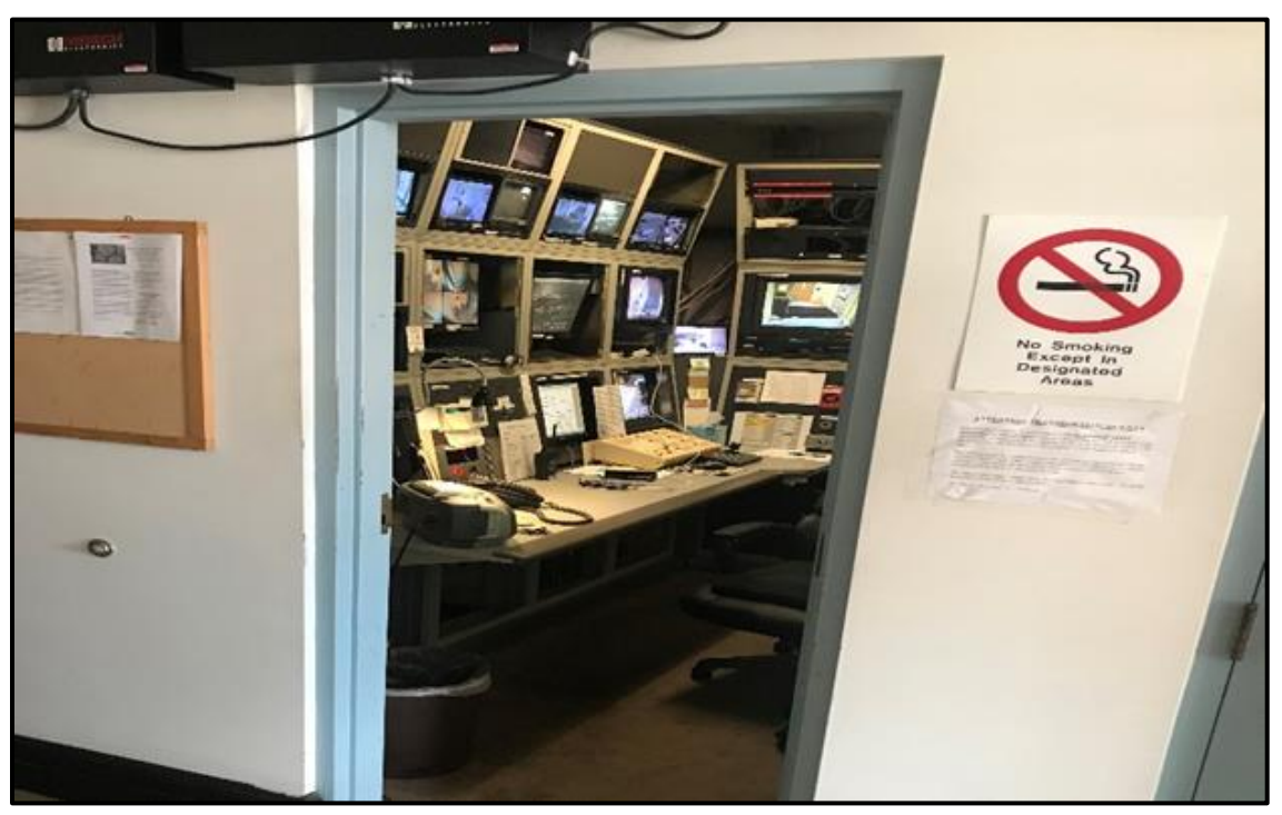
Command and control room along prisoner movement path (prior to renovation)