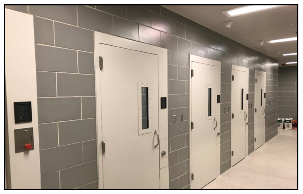
Finished product: holding cells.