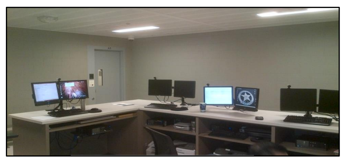
Prisoner processing room constructed to current USMS standards.