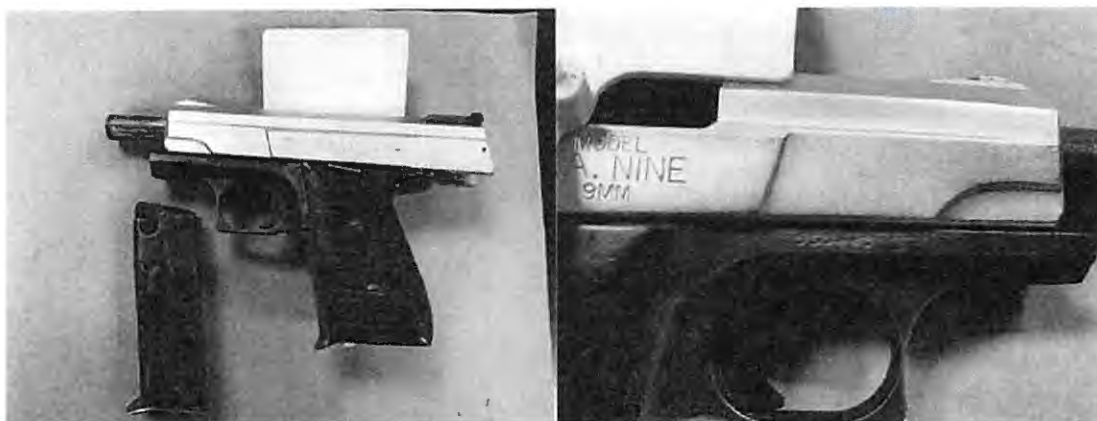
Images of the recovered firearm