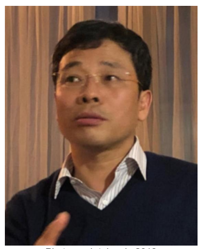
Photograph taken in 2018

Conspiracy to Act in the United States as an Illegal Agent of a Foreign Government