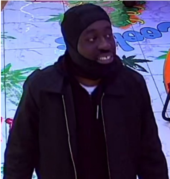
Security Camera Footage April 29, 2023