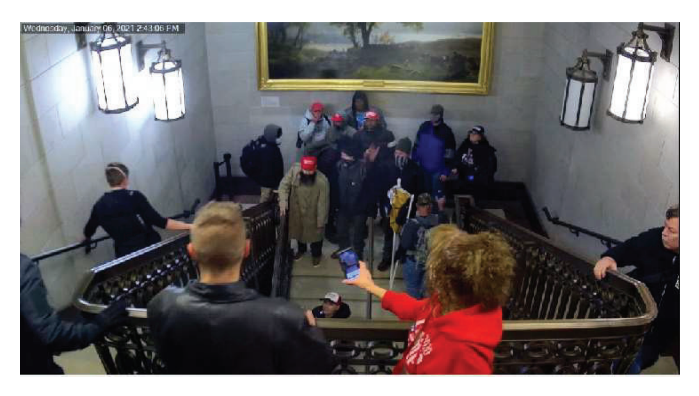
16. As depicted in images above, the woman has a jacket tied around her waist, a cross-