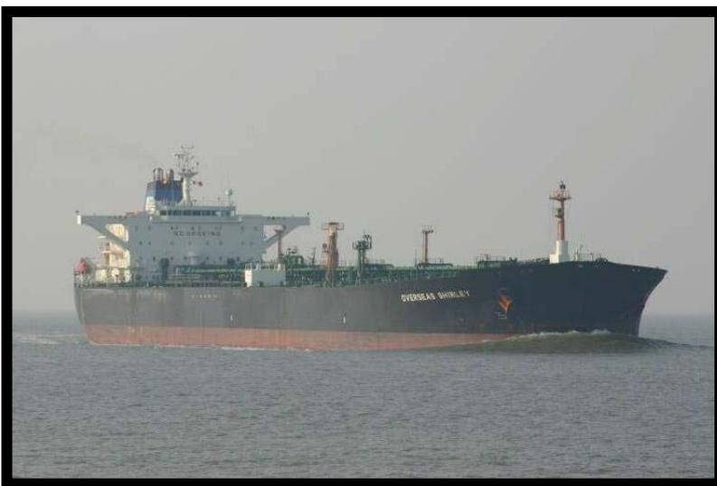
M/T Overseas Shirley

On June 20, 2007, Overseas Shipholding Group Inc., ("OSG ") was ordered to pay a $10 million fine in Beaumont, Texas, which is in addition to the $27 million it was sentenced to pay in March 2007 for violations in Boston, Portland, Maine, Los Angeles, San Francisco, and Wilmington, North Carolina. In addition to that earlier fine, OSG was sentenced to serve a three-year term of probation during which it must implement and follow a stringent environmental compliance program that includes a court-appointed monitor and outside independent auditing of OSG ships trading worldwide.