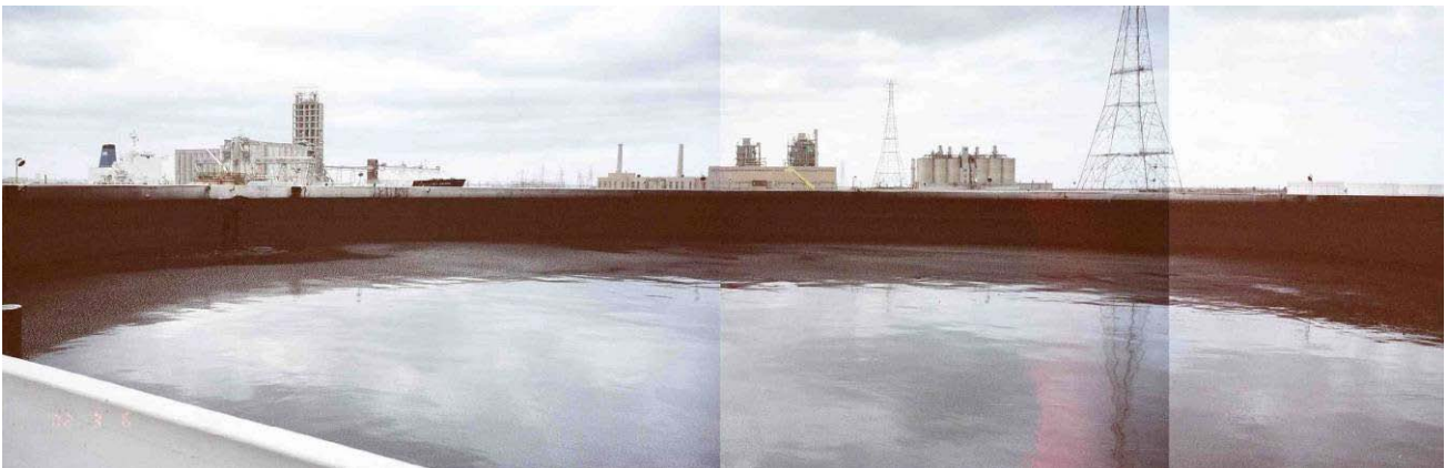
Tank with ten-foot-deep layer of oil