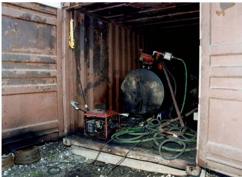
Container with concealed storage tanks

This case was investigated by United States Immigration and Customs Enforcement, the United States Department of Transportation-Office of Inspector General, the General Services Administration-Office of Inspector General, the Broward County Sheriff's Office, the Florida Department of Law Enforcement, the Florida Department of Environmental Protection, the Internal Revenue Service, the Broward County Department of Planning and Environmental Protection, the Broward County Department of Fire Rescue and Emergency Services, and the Broward County Fire Marshall.